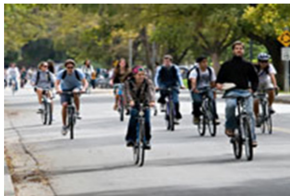
Image 1: People riding on bicycles