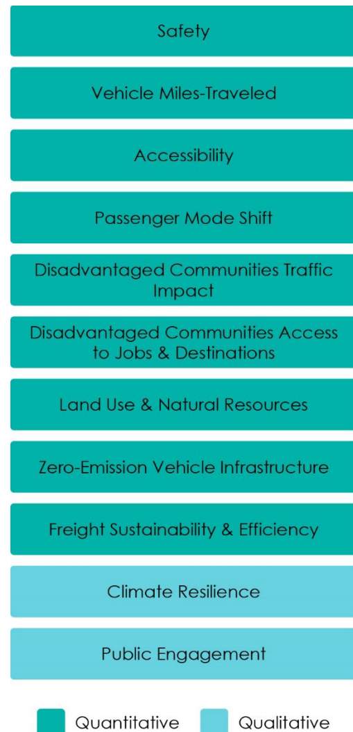
Figure 1: CAPTI Metrics

Each CAPTI Alignment Metric is on a 0-to-10 scale, wherein a project can score a maximum of ten (10) points and a minimum of zero (0) point on each metric. Overall, a project can score a maximum of 110 point. When a project does not provide any data or information on a metric, it is assigned a default score corresponding to a "no change" score.