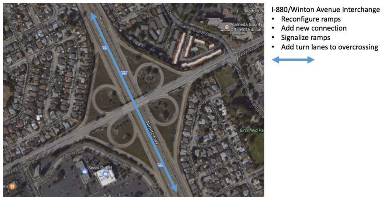
Figure 1 Example of Interchange Project on the PHFS - No Additional Miles Needed