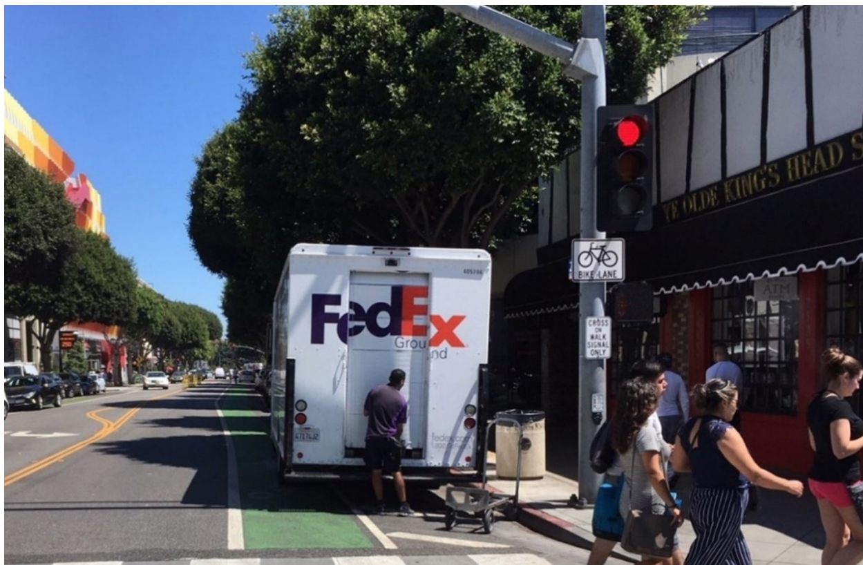
Figure J.4: Curbside Bicycle Lane Complicates Truck Access to the Curb

where double-parking is not possible and the curb or loading zone is occupied, delivery trucks may take unnecessary trips around the block while waiting for delivery access, resulting in an increase in greenhouse gas emissions. According to the Institute of Transportation Engineers (ITE), "it is becoming increasingly important to designate loading zones not only in commercial or industrial areas, but also in residential areas where the frequency of package deliveries may result in blockages for other curbside uses". 438