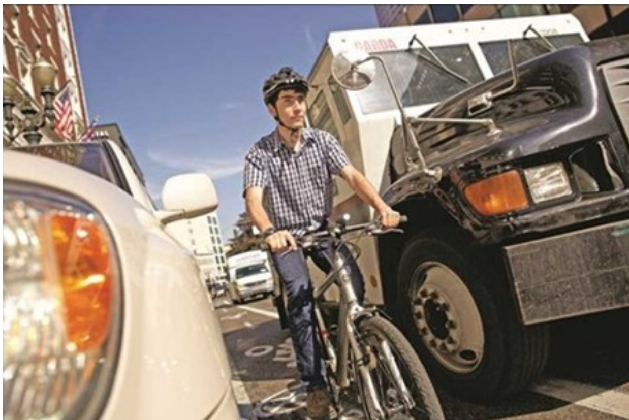
Figure J.3: Bicycle Truck Proximity on Urban Streets

A major barrier for the urban goods movement industry that contributes to traffic congestion and safety concerns is access to the curb for freight loading and unloading. The demand for curb space has increased in recent years considering the advent of TNCs such as Uber and Lyft and the growing volume of package deliveries spurred by the e-commerce boom. When delivery trucks are unable to access the curb or loading zone at their destination, they often double park and occupy a travel lane, which increases congestion and potentially reduces safety by limiting visibility in the roadway and forcing cars to travel around double-parked trucks. On streets with bicycle lanes, delivery trucks may effectively block these lanes when double-parked or may be required to pass through them to access the curb, posing safety concerns for bicyclists in both cases by increasing collision risk and forcing bicyclists to mix with vehicular traffic Figure J.4 436