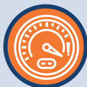
Speed Management / Aggressive Driving