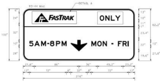
New Express Lane Sign Panel