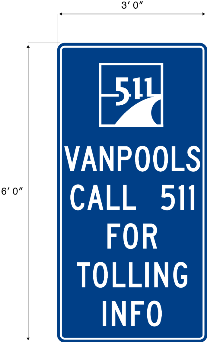
Exhibit A: Proposed Traveler Information Sign