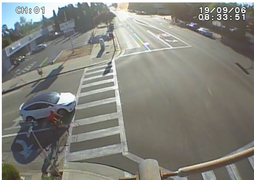
When a car covers the bike box, bicyclists sometimes choose to wait on the right side of the vehicle.

As can be seen in Table 3.3 above, over all periods observed, vehicles covered the through-lane bike boxes approximately 45% of the time, and stopped before it, leaving it accessible, 55% of the time. Some motorists appeared willing to comply with the regulation, while others simply ignored the box or did not understand the provision to stop prior to it. Video observations revealed that some motorists chose to stop before the bike box, and then, after waiting for some time, pull closer to the intersection; these motorists were counted as stopping before the bike box. A small number of motorists covered the bike box as a result of excessive traffic; vehicles would wait for the vehicle queue across the intersection to clear prior to crossing, pulling right up to the intersection (in the bike box). Most vehicles covering the bike box, however, did so without influence from a traffic queue. It appeared that motorists were more likely not to cover the bike box when pedestrians were present in the crosswalk.