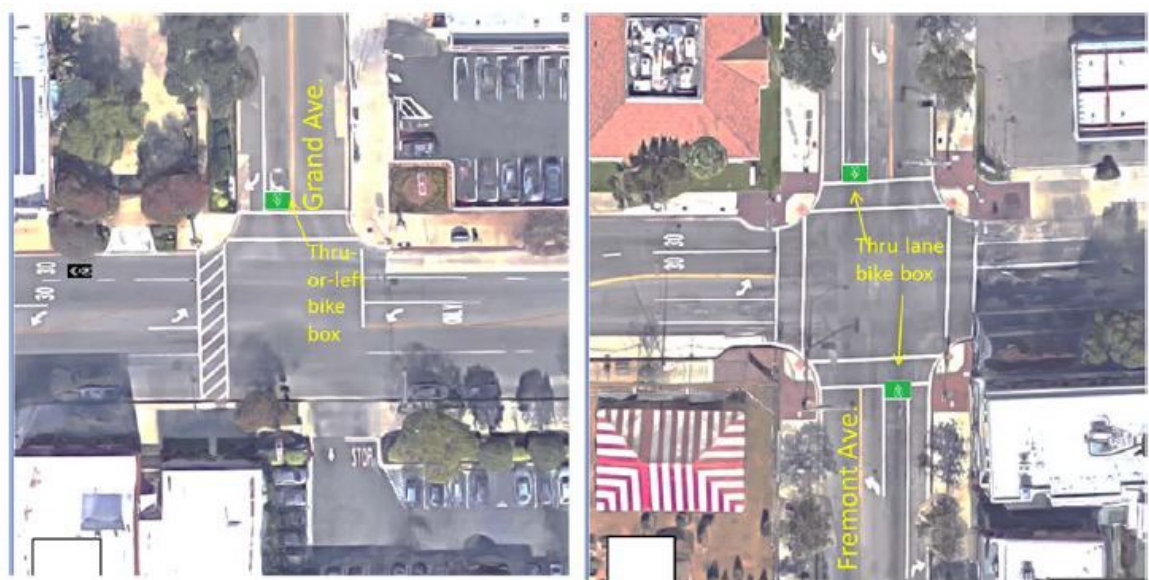
Concept design showing location of through-lane bike boxes at each intersection.

However, due to the lack of lateral roadway space, a bike lane was not provided upstream to feed into the bike box.