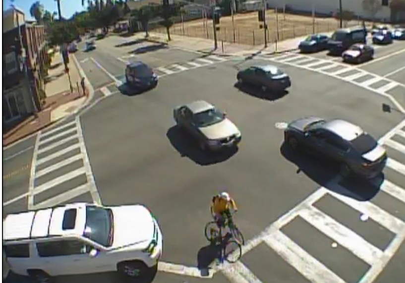
Bicycles traveling on the right side of through traffic may encounter conflicts from other movements in the intersection.