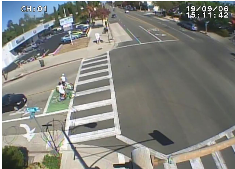
A pair of bicyclists stops on the bicycle box at Grand Avenue & Mission Street