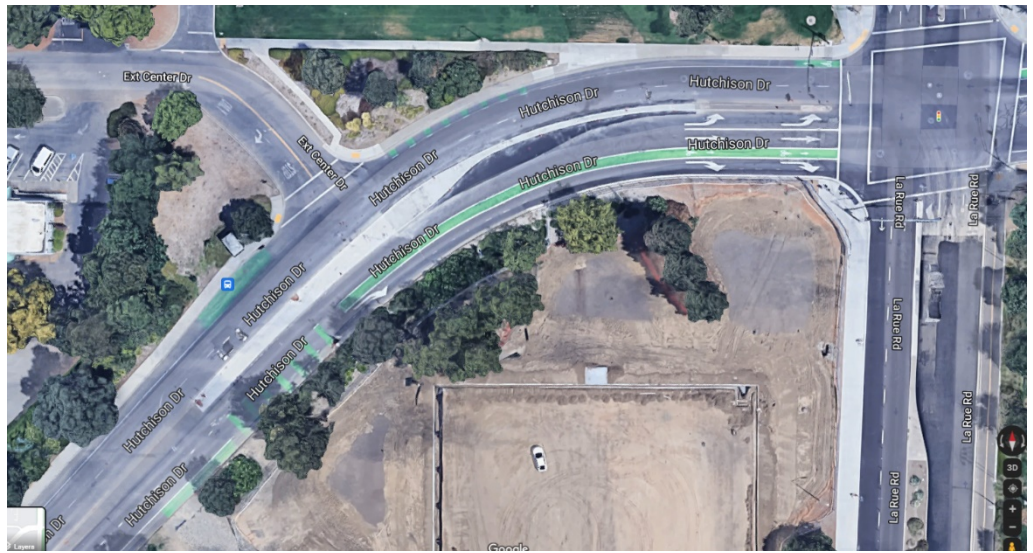
Davis, CA Hutchinson Dr. and La Rue Dr.

Source: Google Aerial Image <a href="https://www.google.com/maps/place/Davis,+CA/@38.5388677,-121.761777,107m/data=!3m1!1e3!4m5!3m4!1s0x80852999495543f:0xc3013f1b6ee28fff!8m2!3d38.5449065!4d-121.7405167">https://www.google.com/maps/place/Davis,+CA/@38.5388677,-121.761777,107m/data=!3m1!1e3!4m5!3m4!1s0x80852999495543f:0xc3013f1b6ee28fff!8m2!3d38.5449065!4d-121.7405167</a>