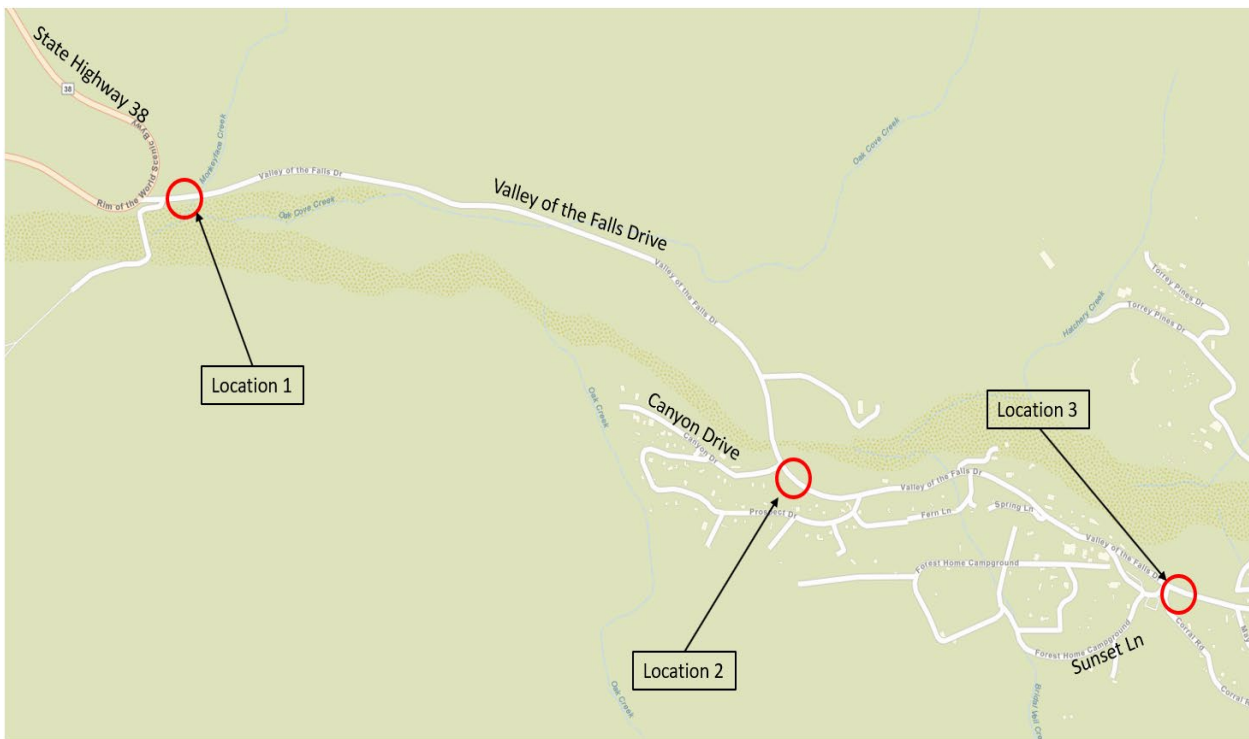
Figure 3. Proposed Location Map