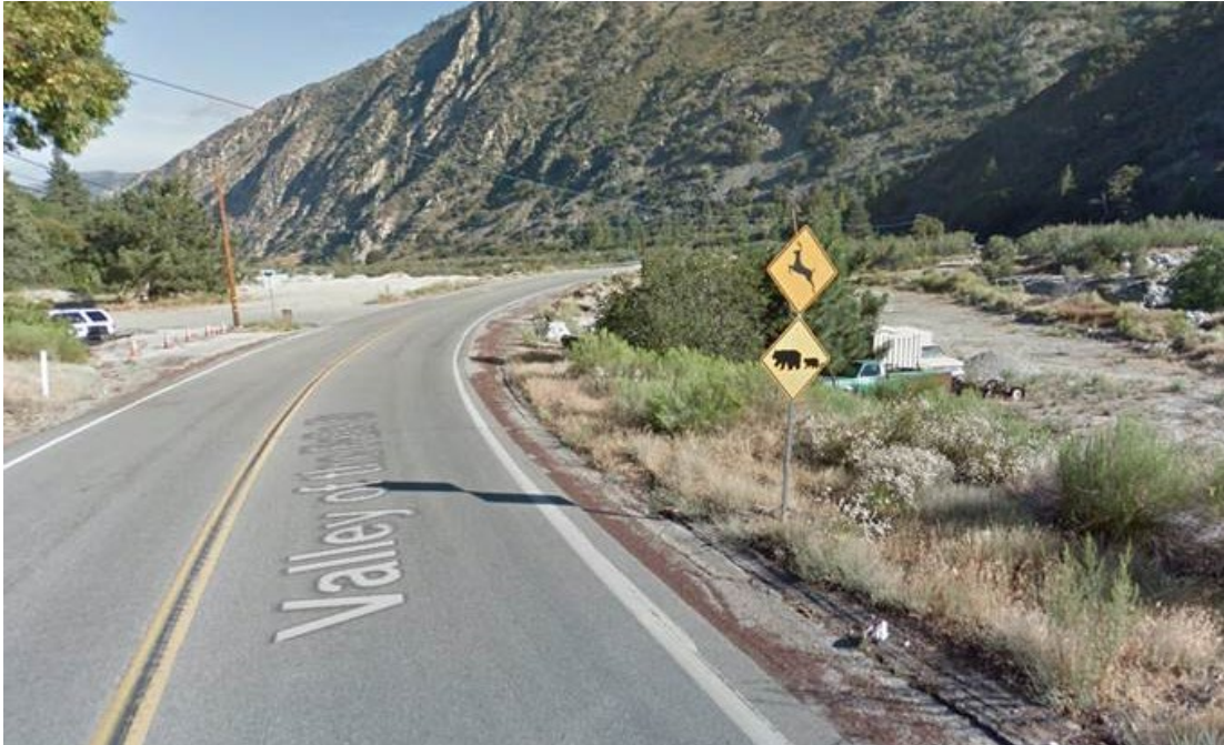
Figure 1. W-13 and W-16 signs at Valley of the Falls Drive

As shown in the figure above, there are two existing signs in Forest Fall area for both deer and bear crossing, and a third sign was also installed at this location for big horn sheep. Installing multiple animal warning signs within a close range will requires extra funding, time, and effort for maintainance.