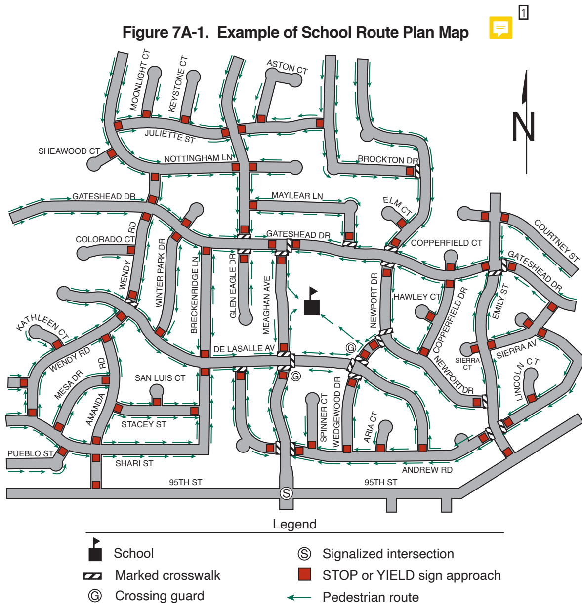
Figure 7A-1. Example of School Route Plan Map