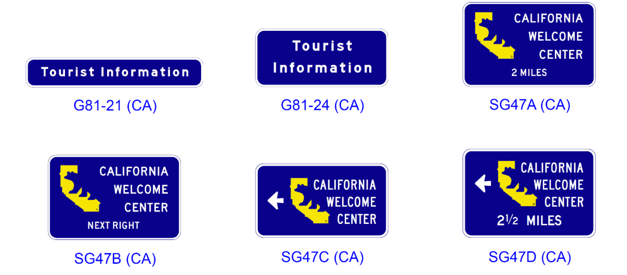
Figure 2I-7 (CA). Examples of Tourist Information and Welcome Center Signs