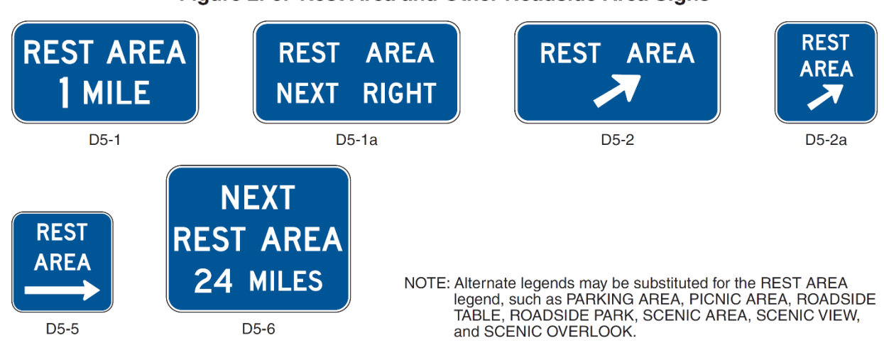
Figure 2I-5 (CA). Rest Area and Other Roadside Area Signs