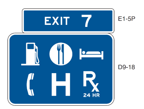
Figure 2I-3. Examples of General Service Signs with and without Exit Numbering

FOOD - PHONE GAS - LODGING HOSPITAL CAMPING