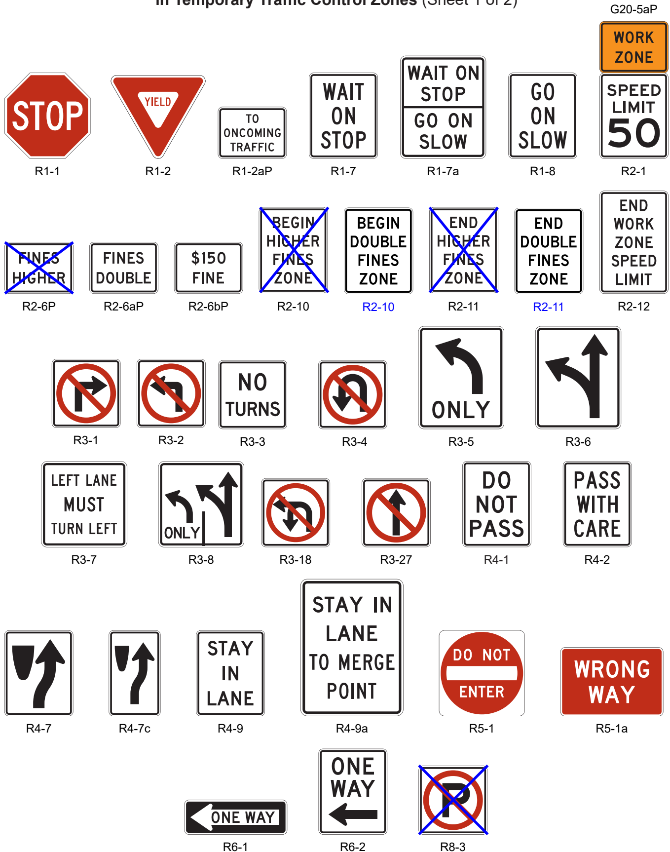
Figure 6G-1. Regulatory Signs and Plaques in Temporary Traffic Control Zones (Sheet 1 of 2)

Note: See Chapter 2B for information on the application of these signs.