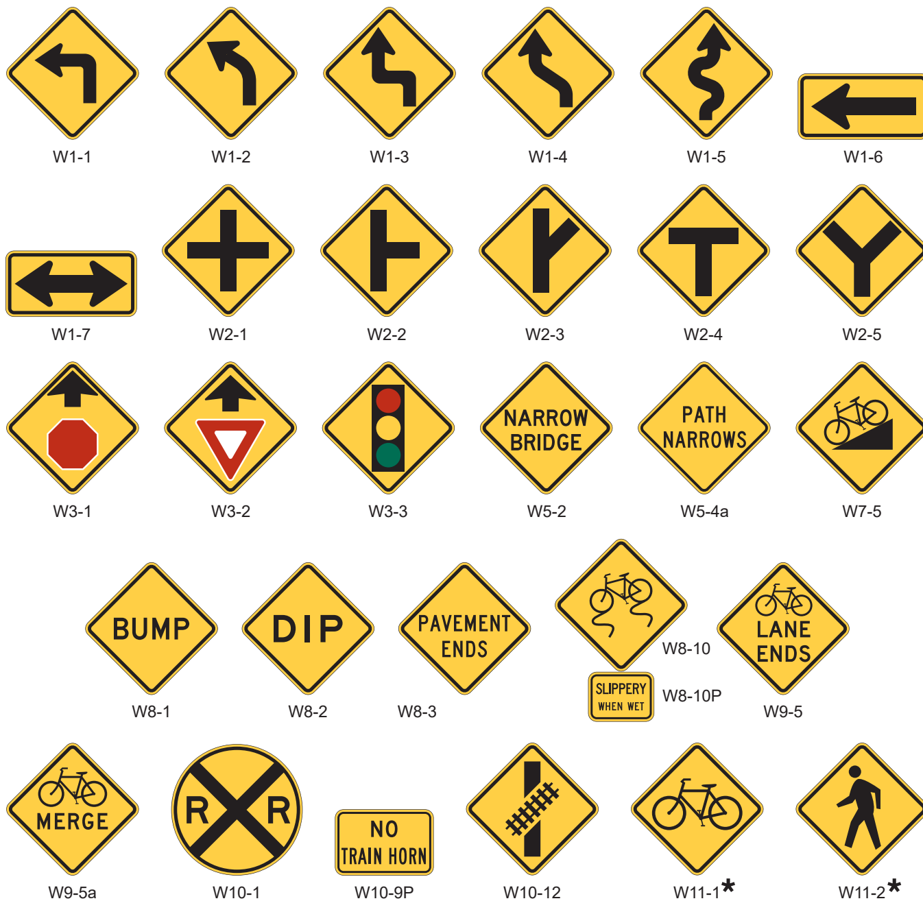
Figure 9C-1. Warning Signs and Plaques and Object Markers for Bicycle Facilities (Sheet 1 of 2)

★ A fluorescent yellow-green background color may be used for this sign or plaque. The background color of the plaque should match the color of the warning sign that it supplements.