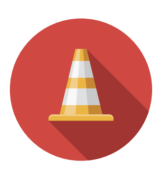
New Safety Guidance