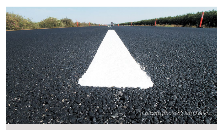
A section of new-generation road striping was recently laid on Interstate 5 near Orland, about two hours north of Sacramento.

It also will be a better roadway guide for autonomous vehicles. Caltrans has consulted with auto