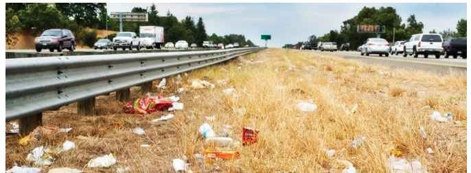
Despite awareness campaigns, Caltrans still fights an uphill battle against roadside trash. Caltrans spent more than $67 million in 2016 keep garbage from reaching storm drains and waterways.

Caltrans owns and operates the state transportation system, which includes 50,000-plus lane miles