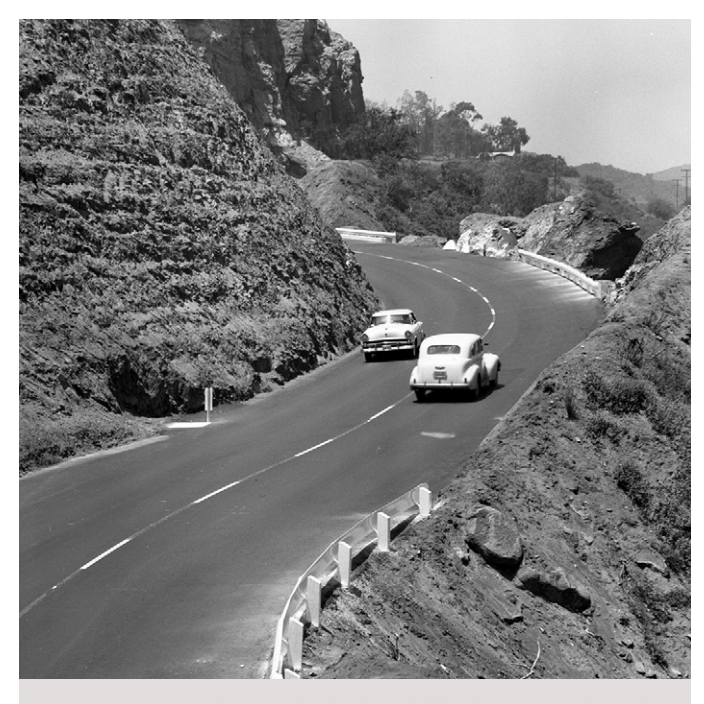
State Route 27 in the 1950s looked much like the route today, other than the vehicles on it. It spans 20 miles in total.