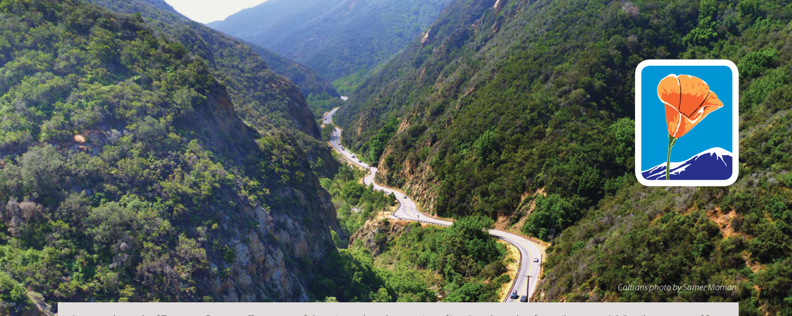
A pastoral stretch of Topanga Canyon offers a peaceful respite to the urban setting of Los Angeles only a few miles away. A 2.5-mile segment of State Route 27 has been designated as a state Scenic Highway, and signs bearing the familiar poppy and snowy peak will soon be put up.

Topanga Corridor Now Part of Caltrans Program That Protects State's Unique Byways