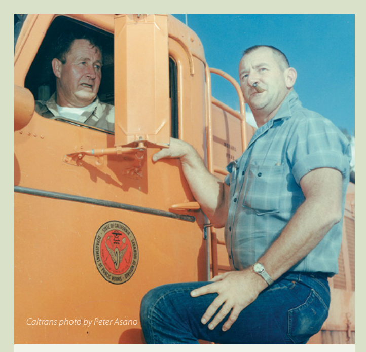
How things have changed: Back in the early days of the Kingvale operation, it obviously was OK to smoke while working. The facility opened in 1962 along one of the Sierra's snowiest sections.

No doubt those skills have been put to good use during this drought-busting season.