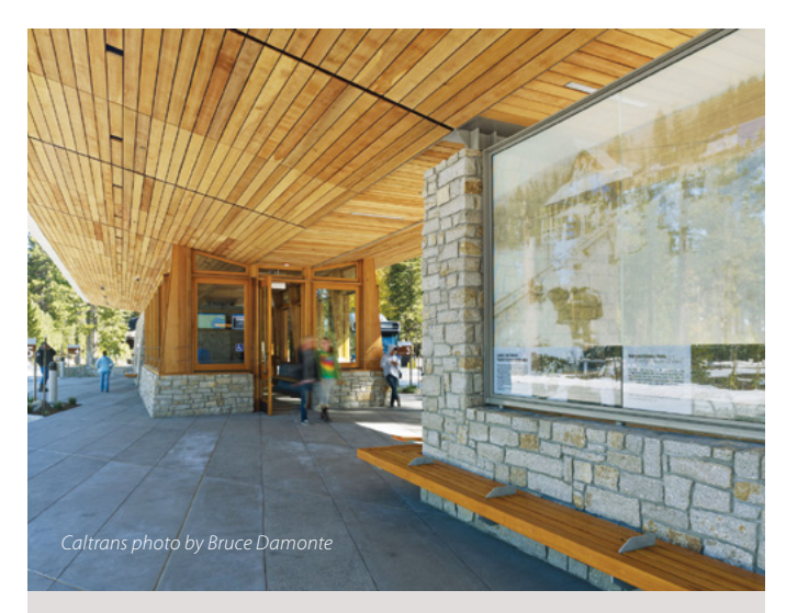
The Tahoe City Transit Center, opened in 2012, was allocated almost $385,000 through Prop. 1B's Public Transportation Modernization Improvement and Service Enhancement Account (PTMISEA).