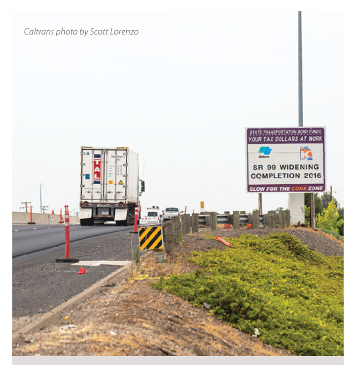
Highway 99 that cuts through the Central Valley received $1 billion in Prop. 1B funds to finance 23 projects along its length from Kern to Tehama counties, including this stretch of 99 near Manteca.

$400 million was dedicated for passenger rail improvements on state-sponsored rail corridors or urban/commuter routes. Nineteen projects have been financed since 2007, resulting in 30 miles of new track and 14 enhanced grade crossings, improvements to three passenger stations, purchase of 22 locomotives and 58 passenger railcars, and replacement of an aging railroad bridge.