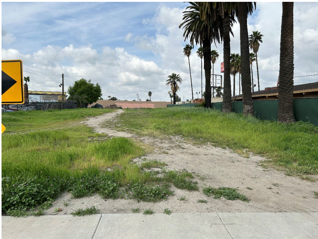
View looking west from N. H Street.