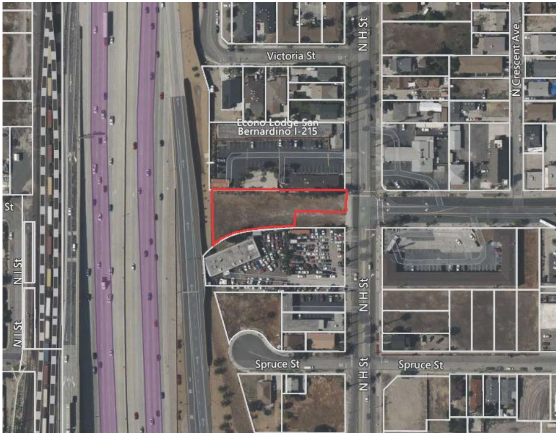
Aerial view of subject property, DD006633-01-01, highlighted in red.

The California Dept of Transportation (Caltrans) will not provide access rights or easement for the purposes of this sale.