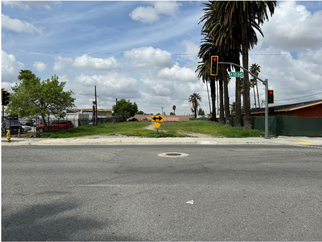
View looking west from W. 6 th Street.