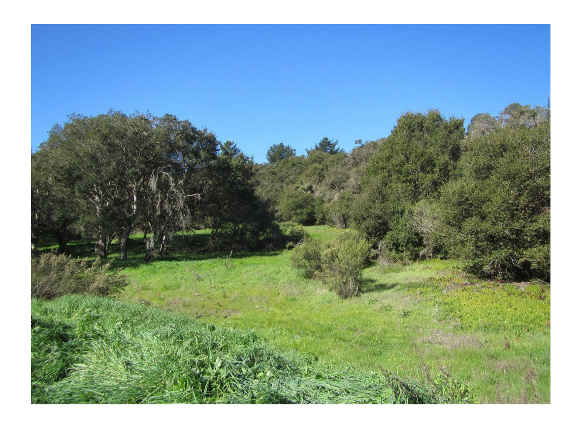
Eastern boundary looking northwest