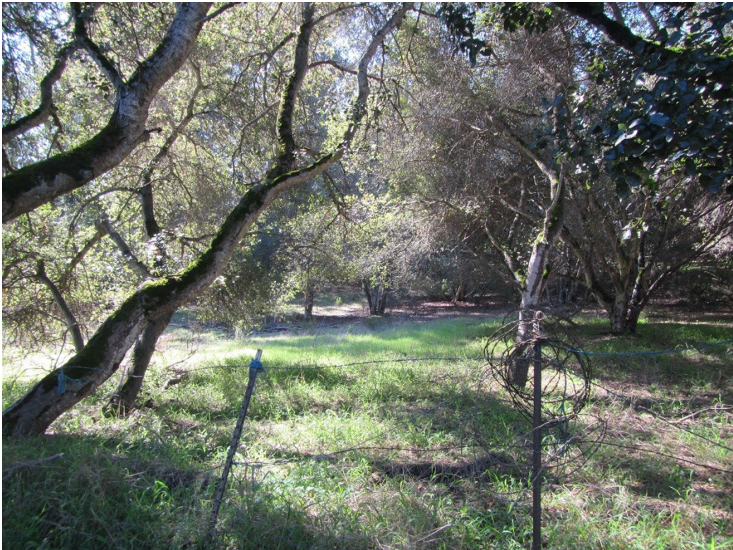
View west over parcel 2851 at upper end of easement