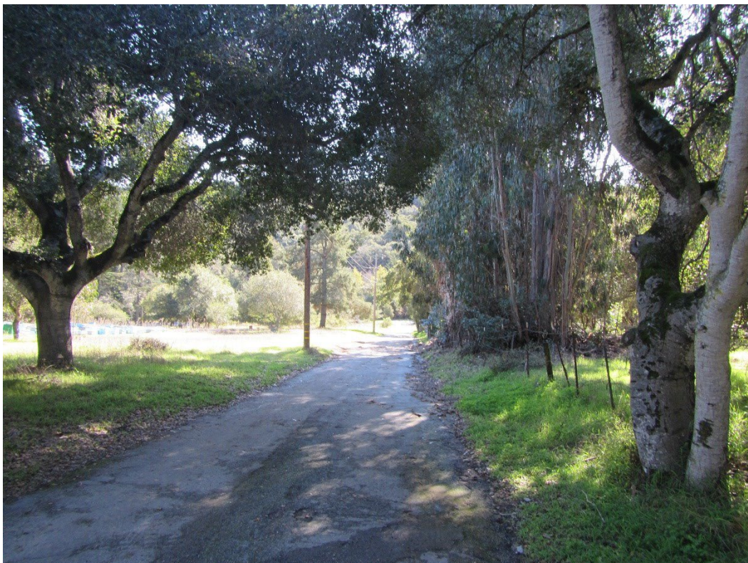
View south from drive 2629 to right left, 2306 to left