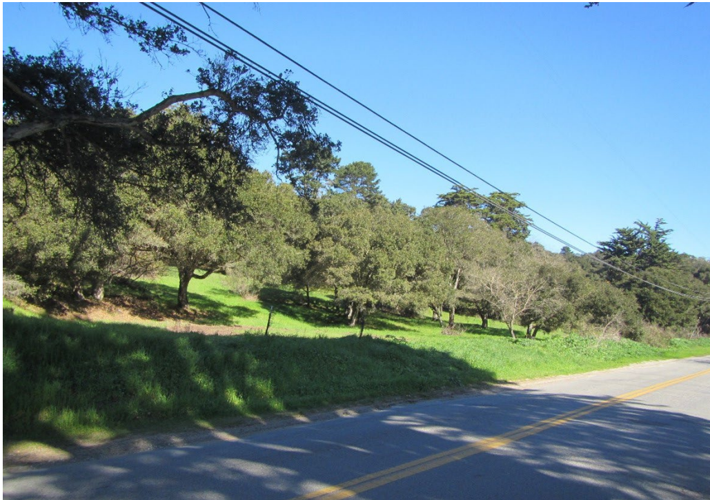
Looking northerly from Vierra Canyon Rd (Parcel 2629)