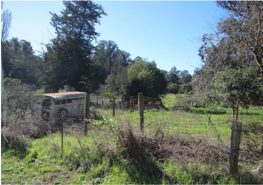
View west from easement over parcel 2629