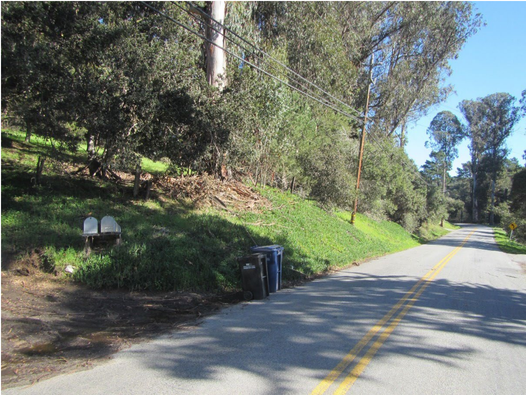
View east from Vierra Canyon Rd (parcel 2897)