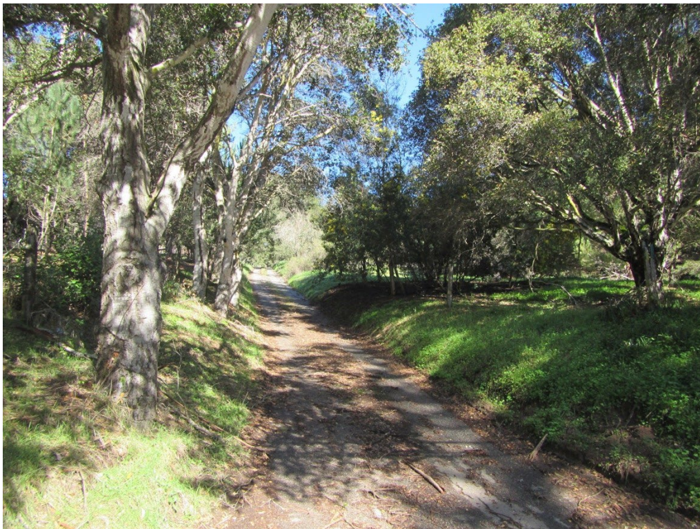
Westerly portion of combined parcel. Looking north from Vierra Canyon Rd, (Over parcel 2897)