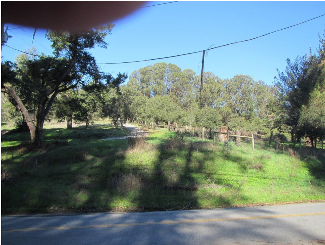
View northward onto parcel 2655 with 2629 to the right from Vierra Canyon Rd.