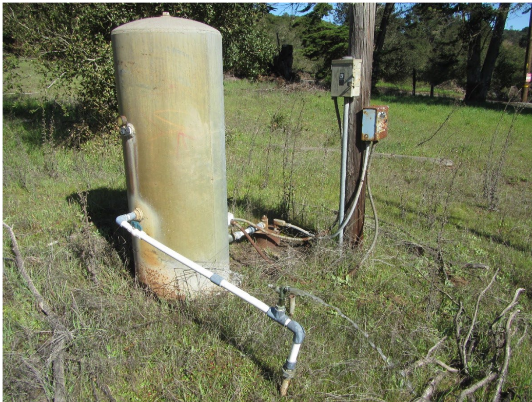
Well site on parcel 2306