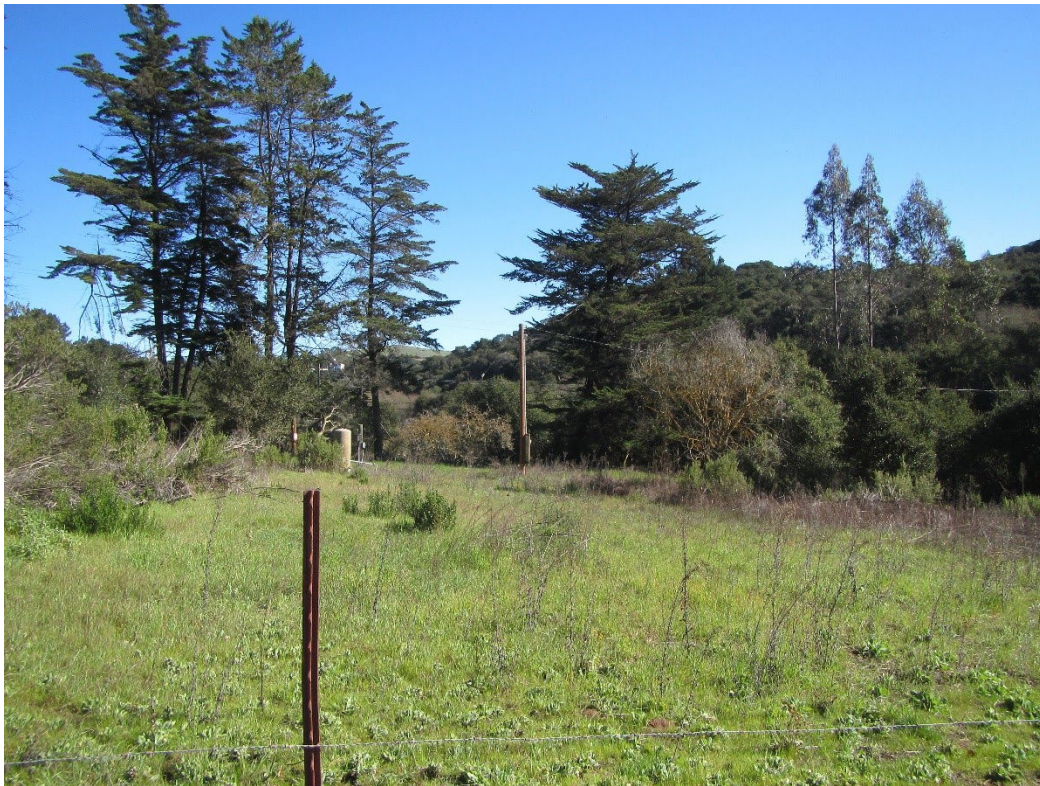
View south from drive 2629 to right left, 2306 to left