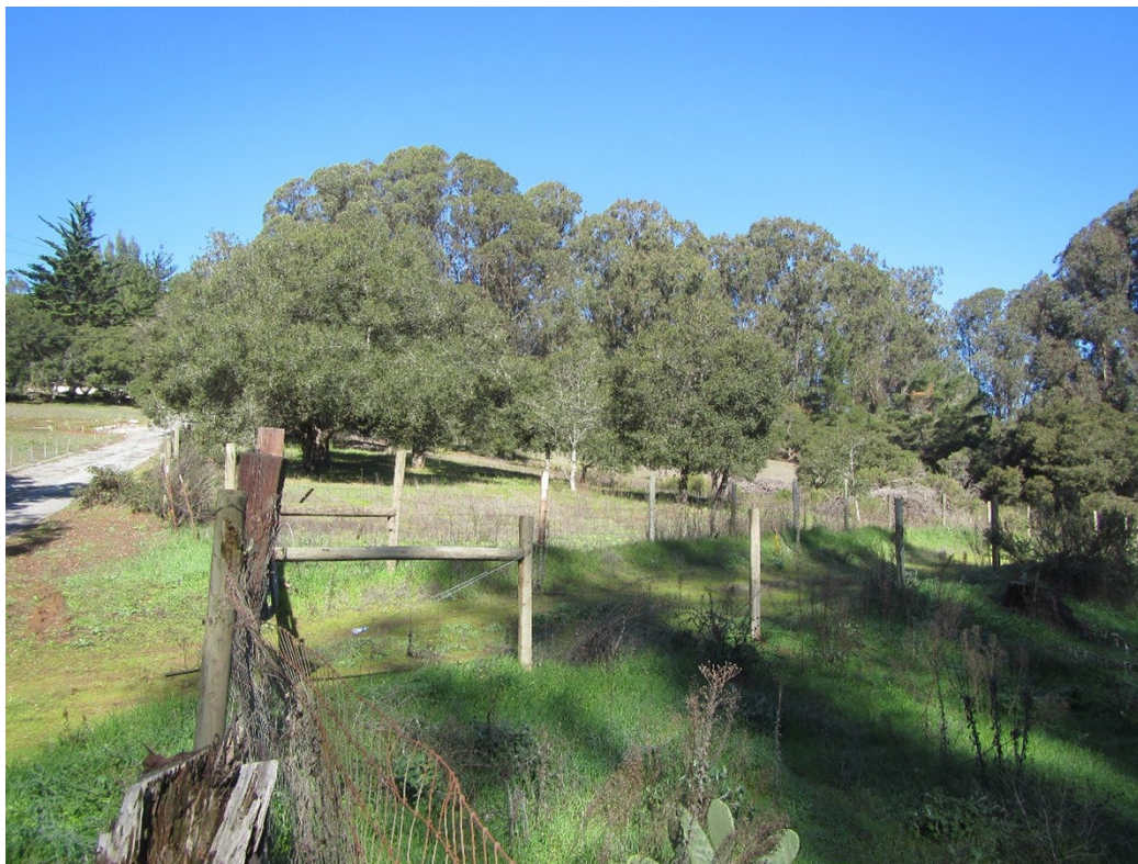
View east onto parcel 2629