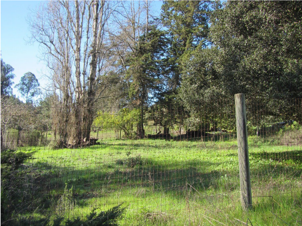
View from Sandy Hill Dr west over parcel 2306