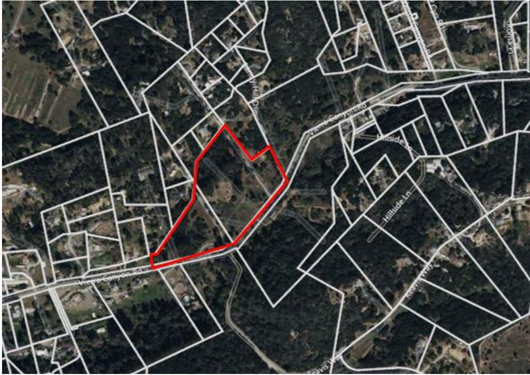
Aerial Photo DD 2306-01-01 Parcel outlined in red