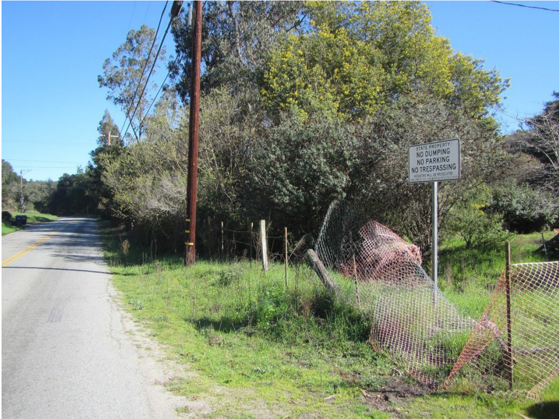
Looking east on Vierra Canyon Rd. Main access gate