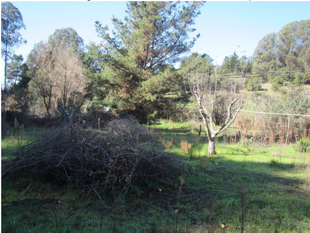
Parcel 2303 looking northward to street