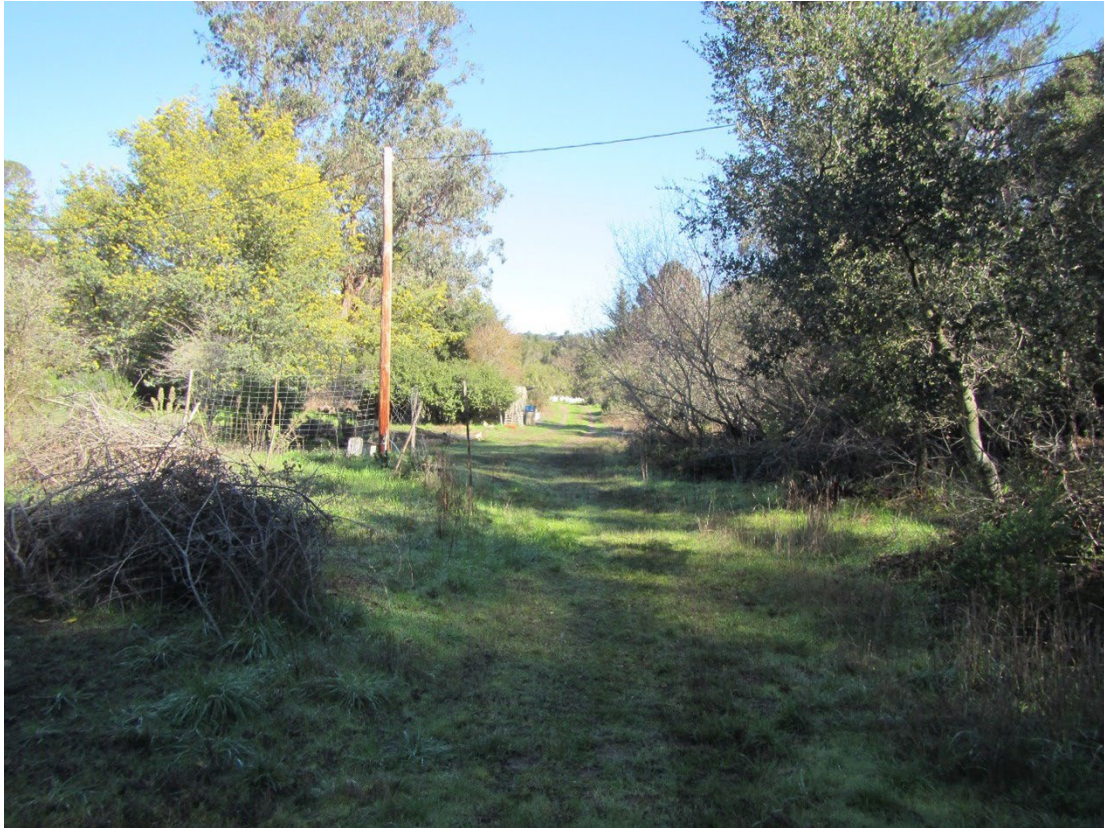
Looking east over 2304-2305 (from parcel 2303)