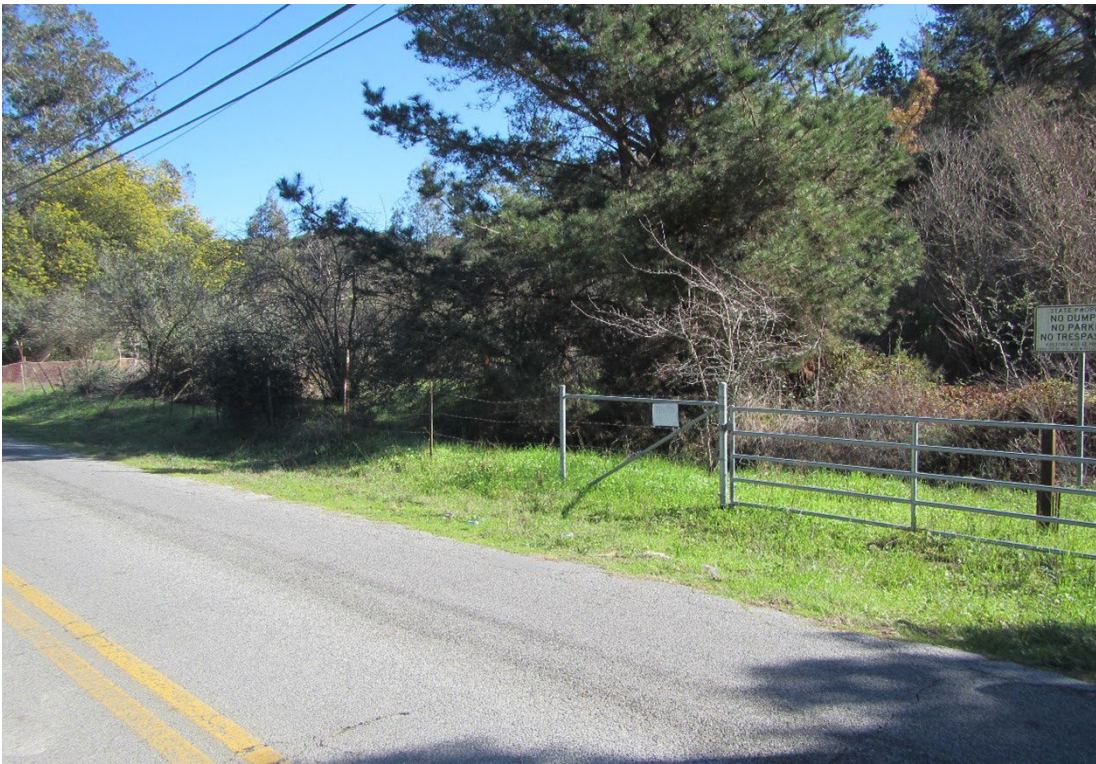
Looking east secondary gate (parcel 2302)