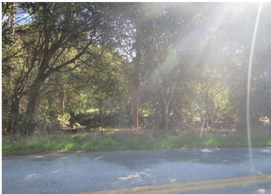
Looking south from Sandy Hill Dr (Parcel 2656)