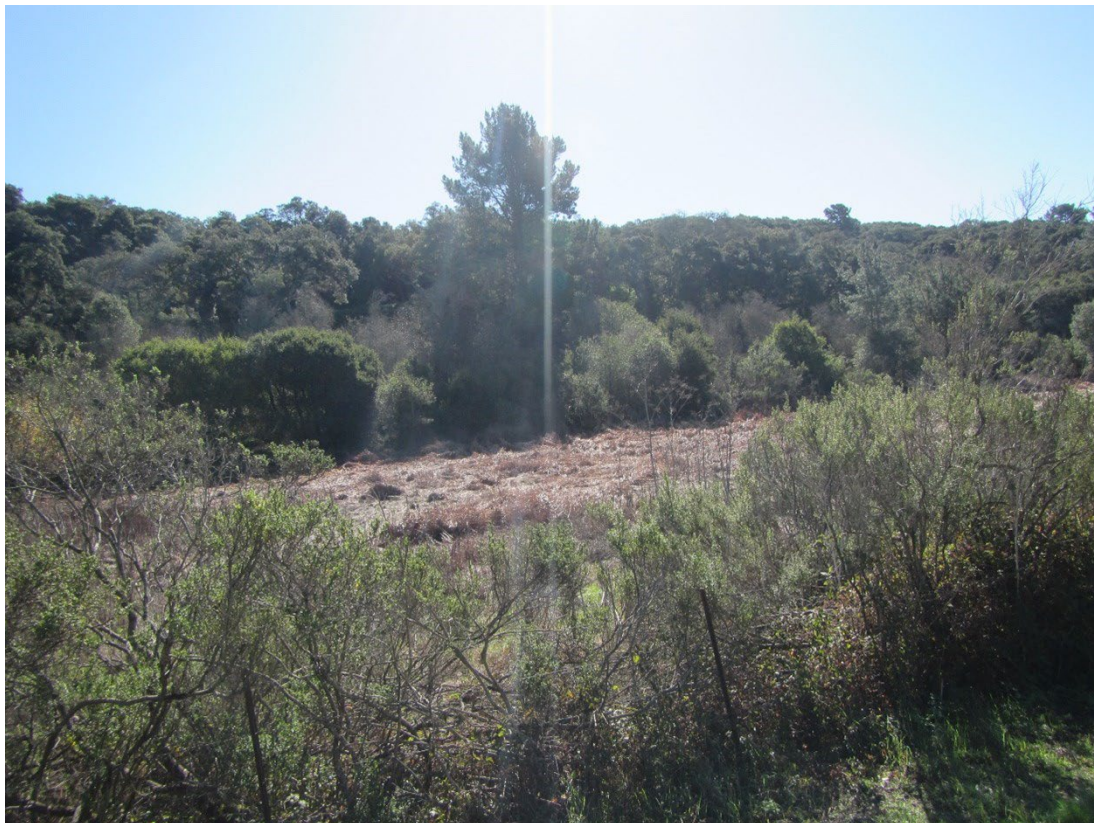
Eastern edge of parcel looking south (parcel 2657)