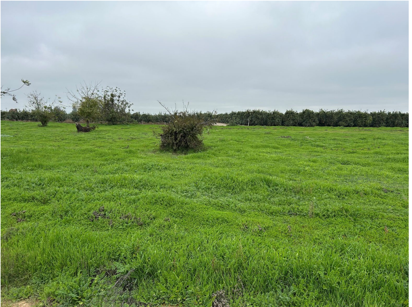
Looking north at the parcel.