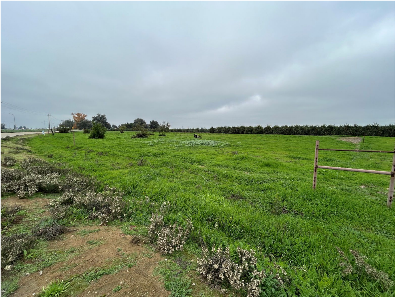
Looking northwest at the parcel.