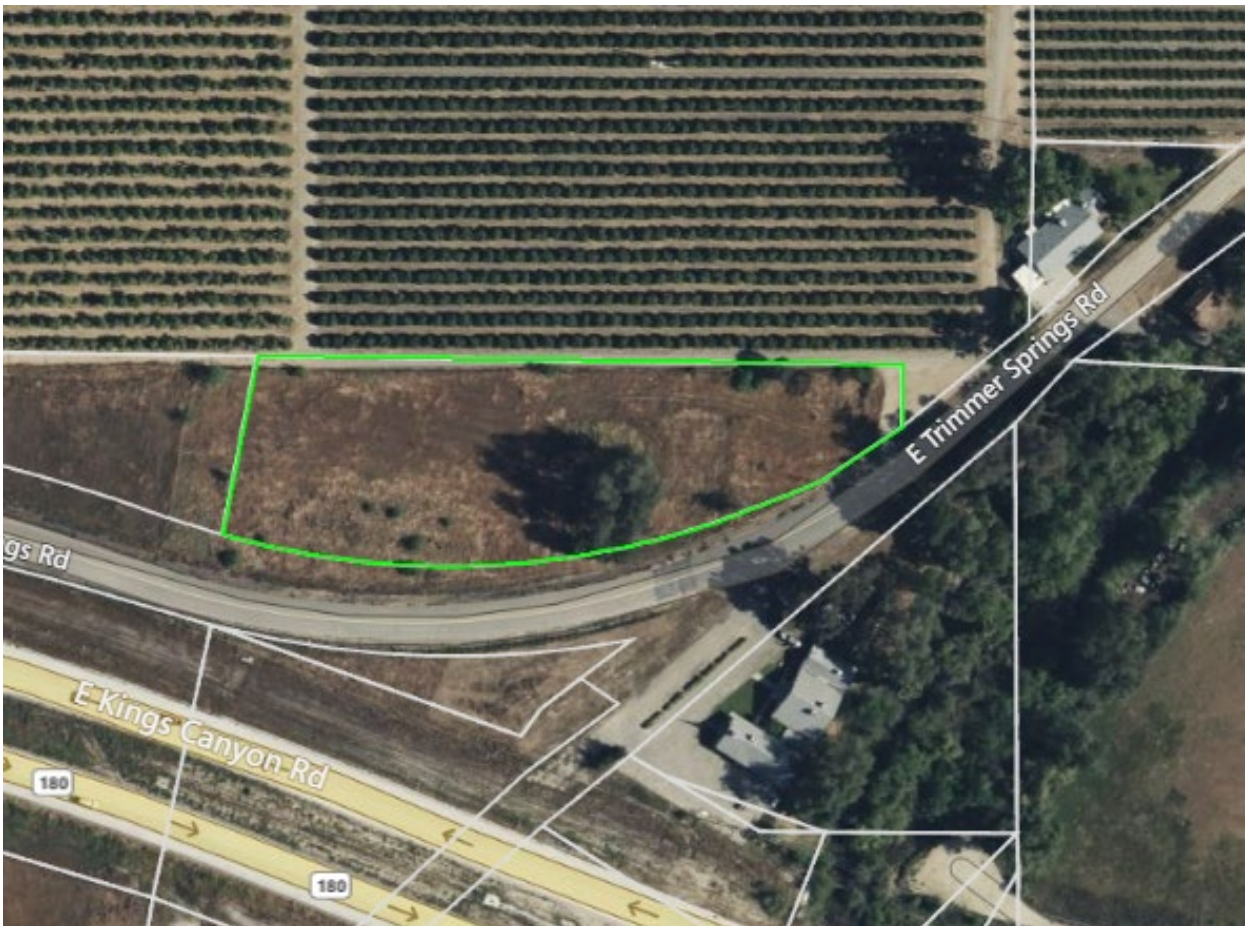
DD 86016-01-01 Aerial View (Drawing is not to Scale)