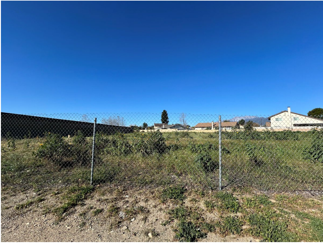
Looking west from Cactus Avenue.