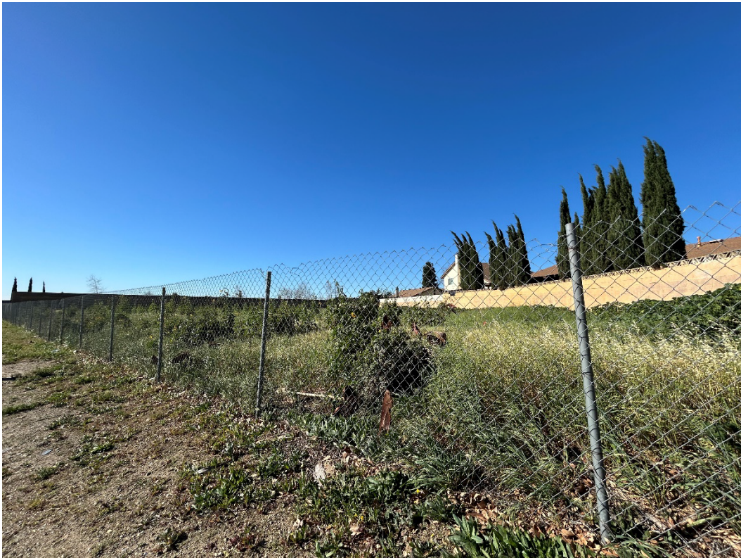
Southwesterly view of the subject parcel from Cactus Avenue.