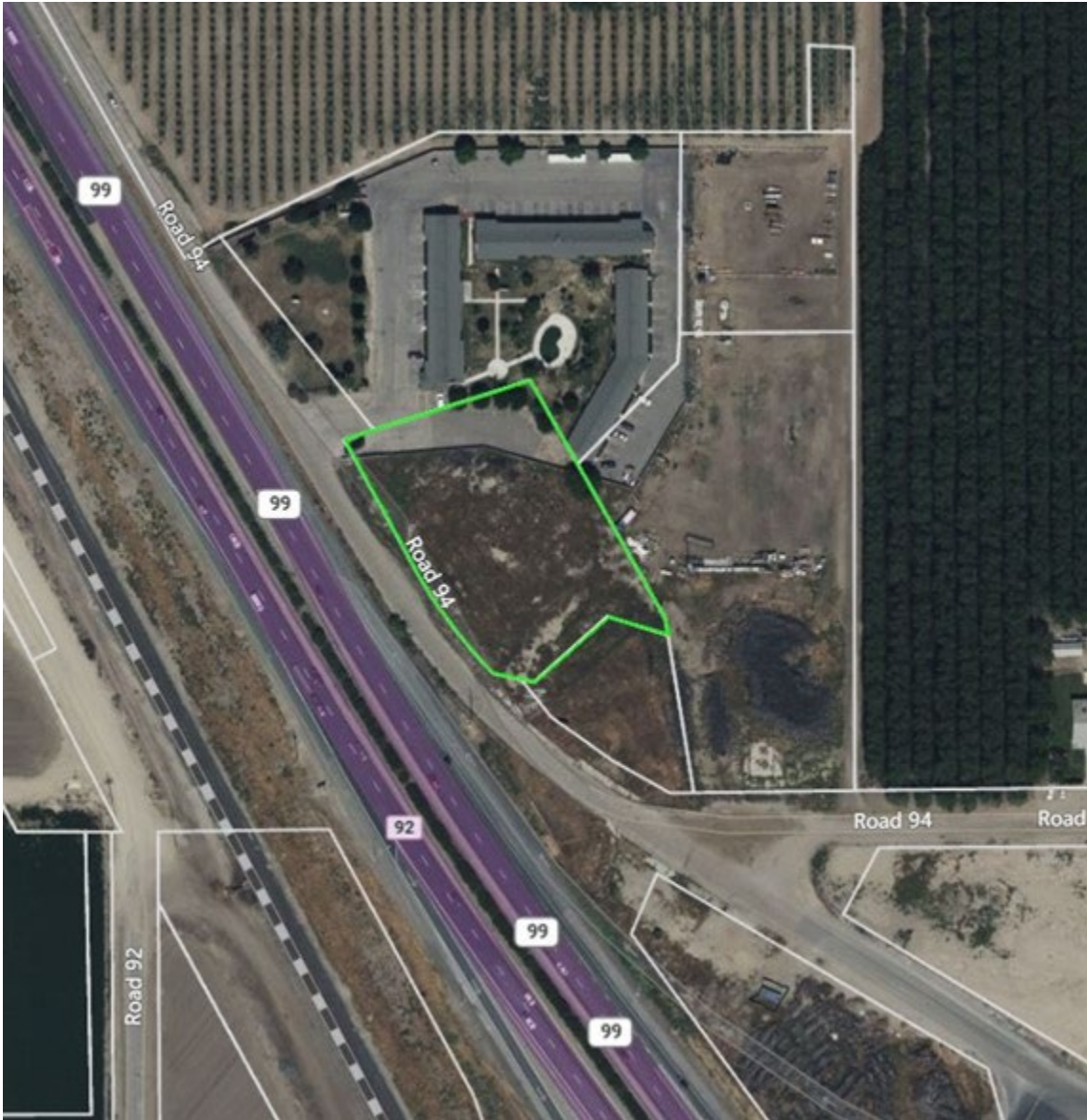
DD 86917-01-01 Aerial View (Drawing is not to scale)