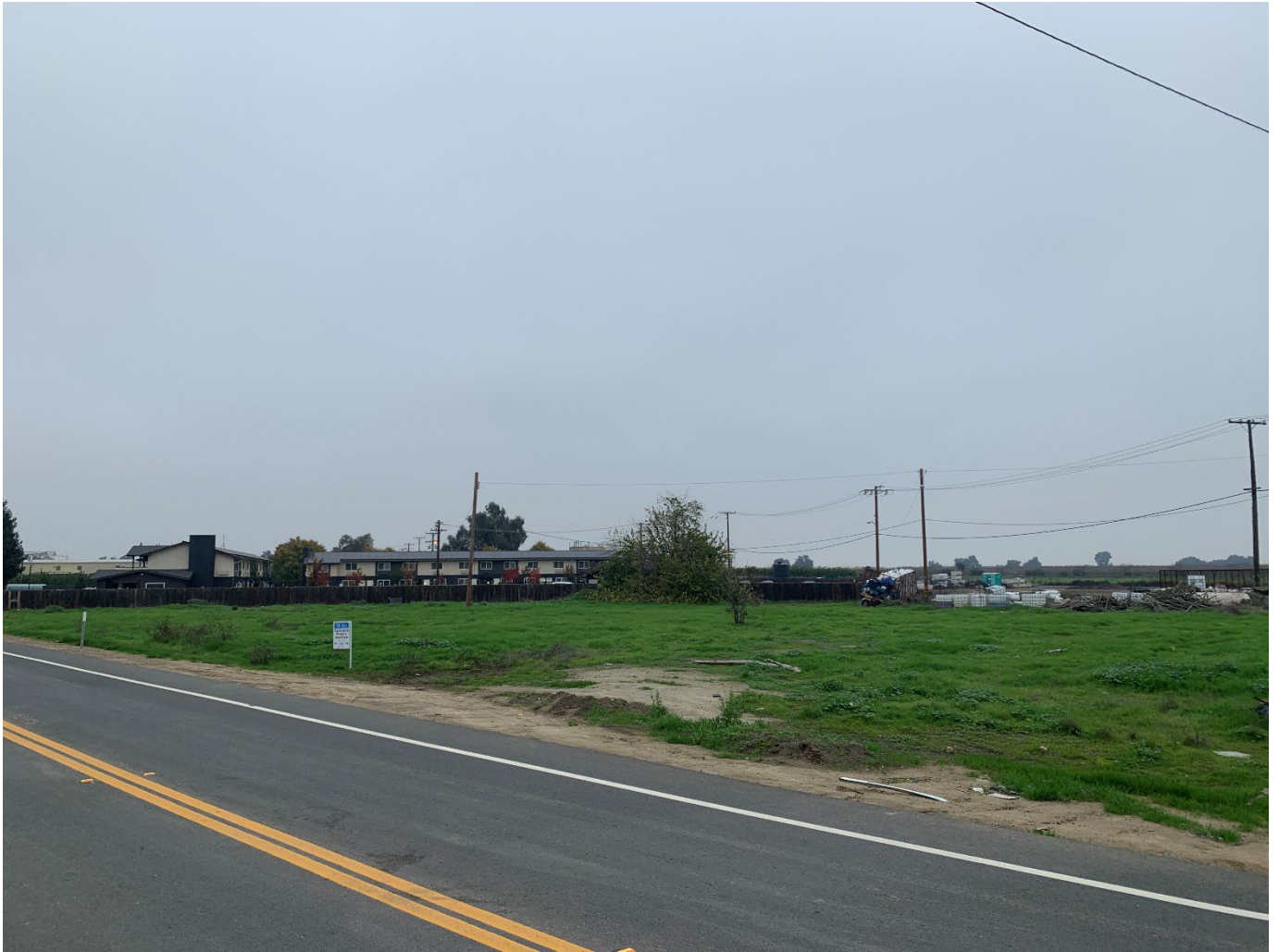
Looking northeast at the parcel.