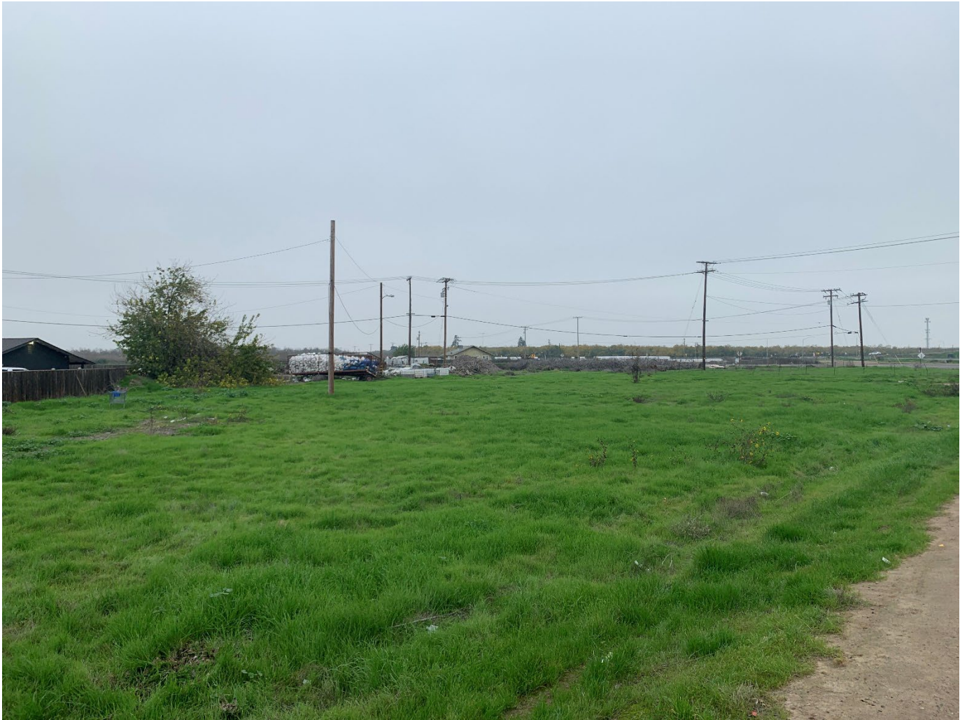
Looking southeast at the northwest corner of the parcel.