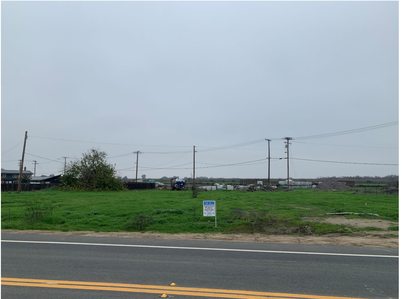
Looking east at the parcel.