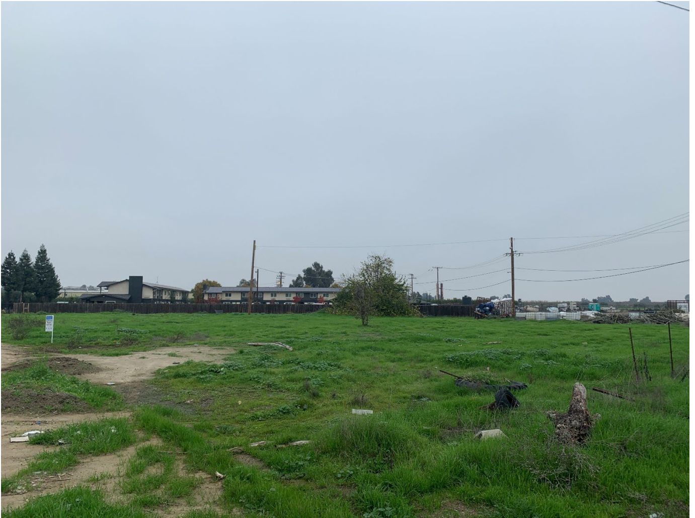
Looking northeast from the southwest corner of the parcel.