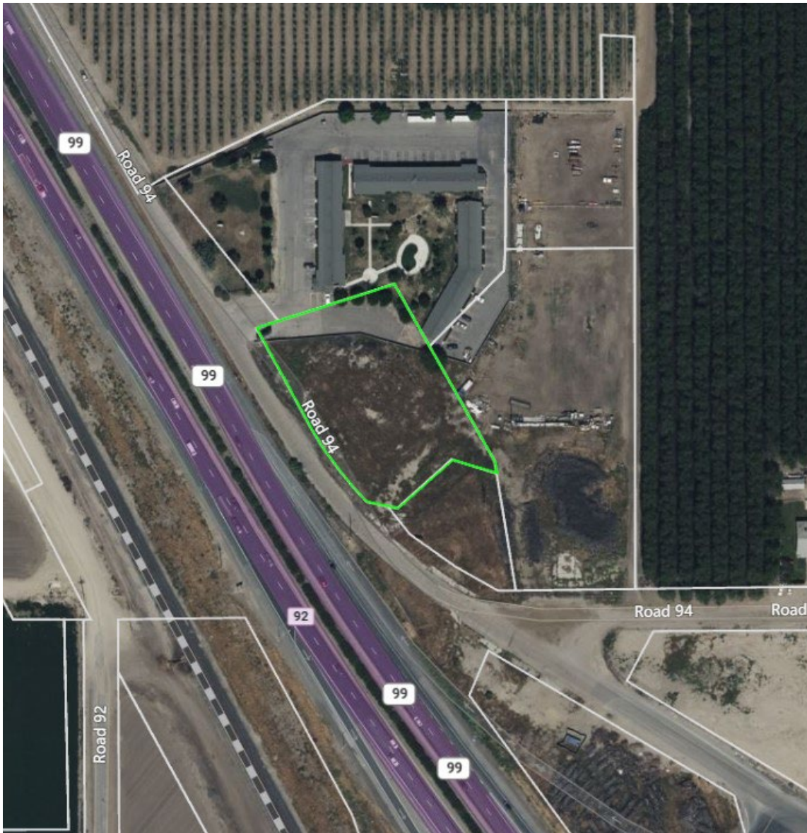
DD 86917-01-01 Aerial View (Drawing is not to scale)