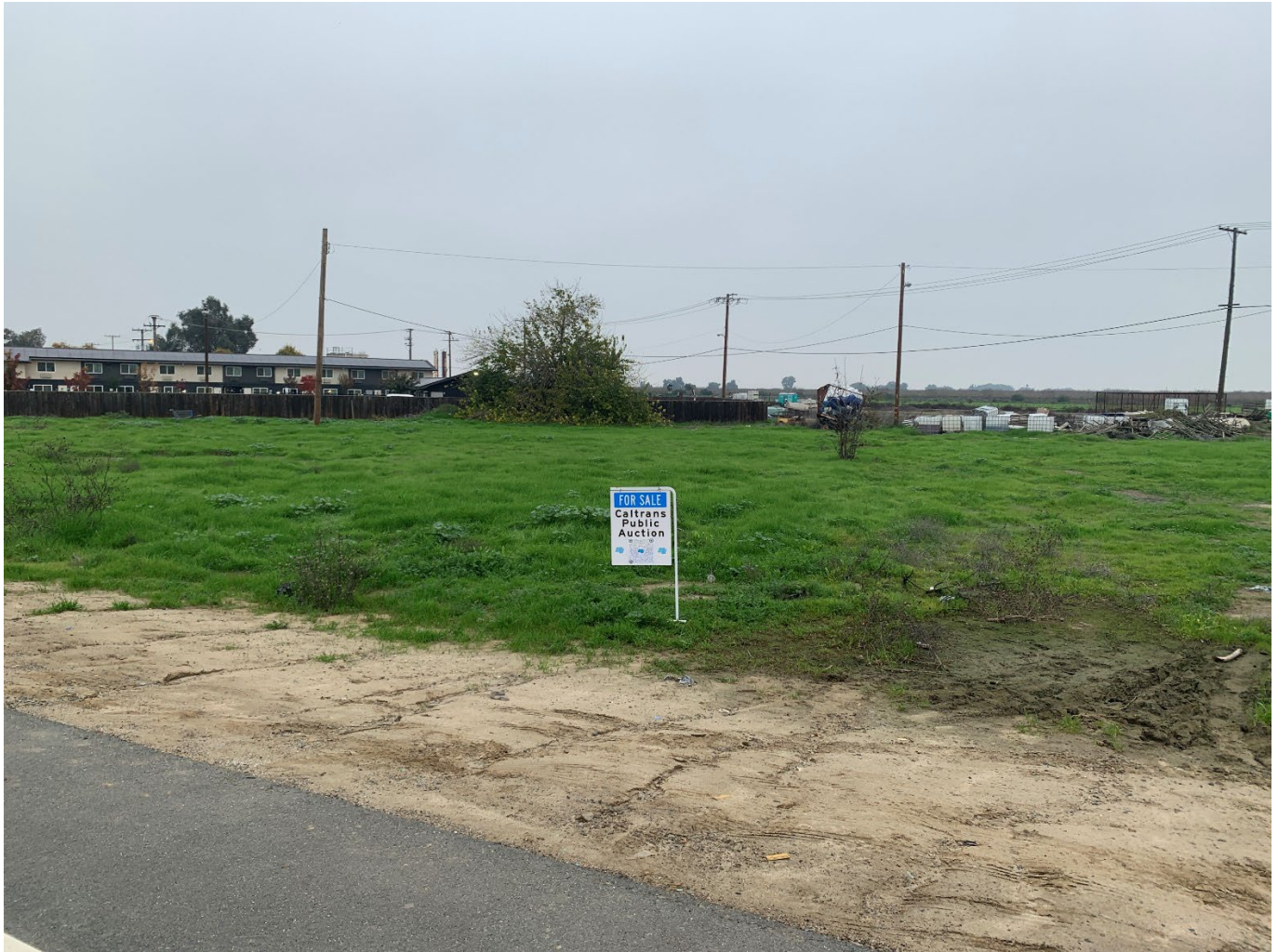
Looking northeast at the parcel