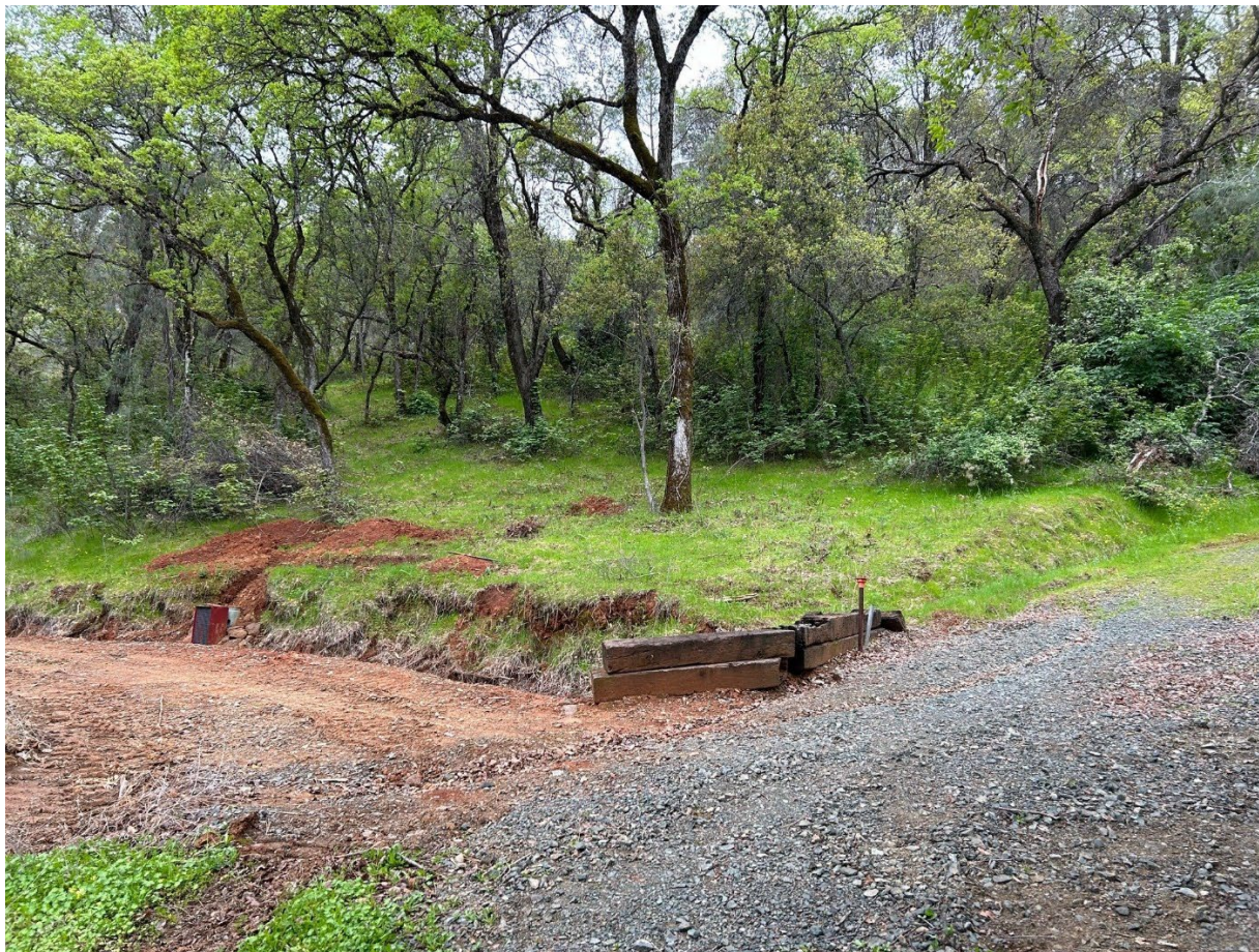
A dirt road leading to a sloping lot full of trees, grass, and foliage.