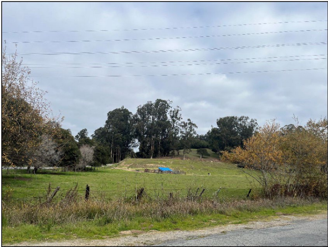
Photograph facing north, from Pesante Road