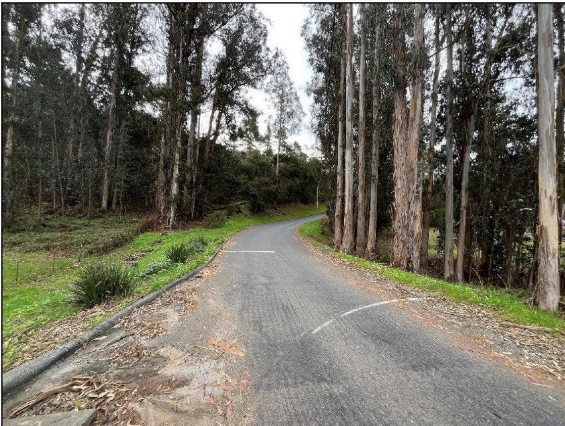
Photo facing southeast at Reavis Way