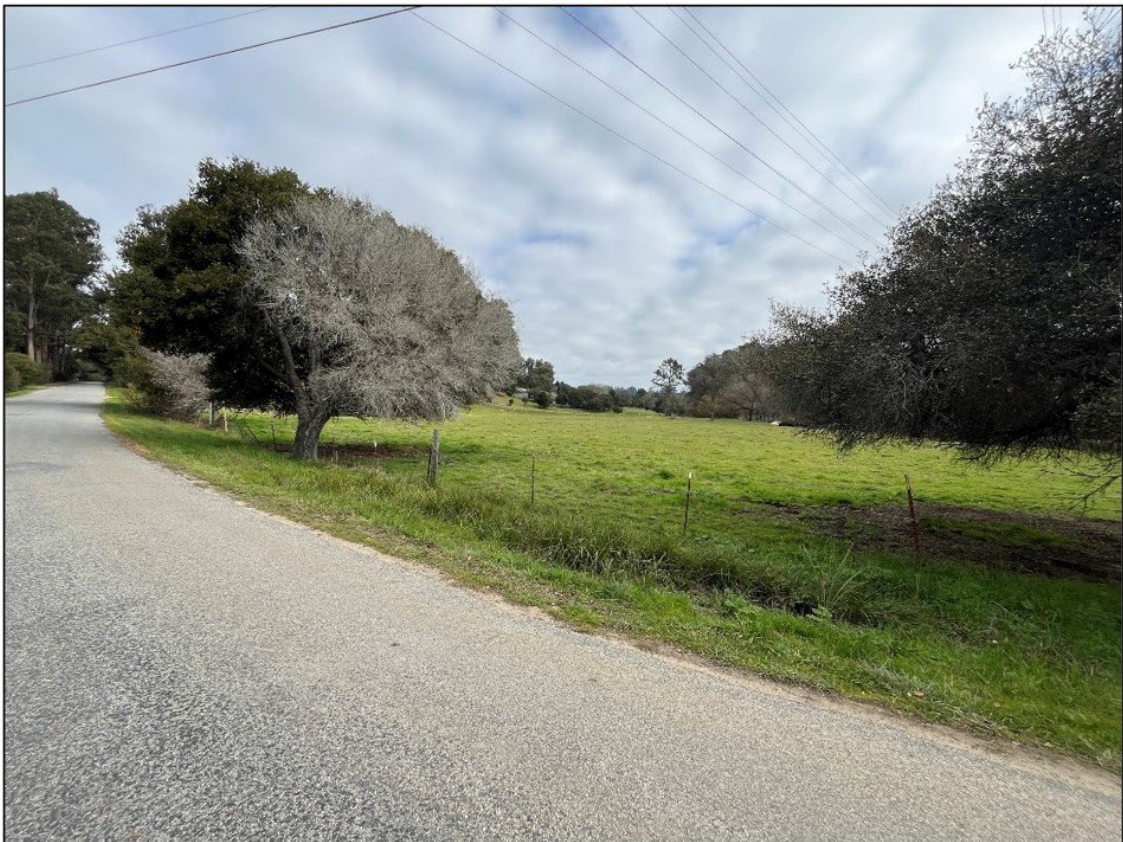
Photo facing northeasterly near the corner of Holly Hill Dr. and Pesante Rd.