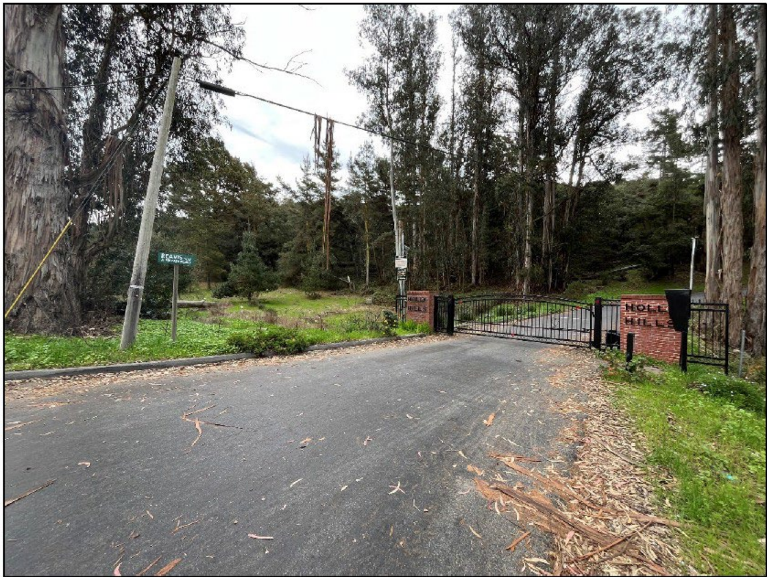
Photo facing east, near the corner of Reavis Way and Vierra Canyon Rd.