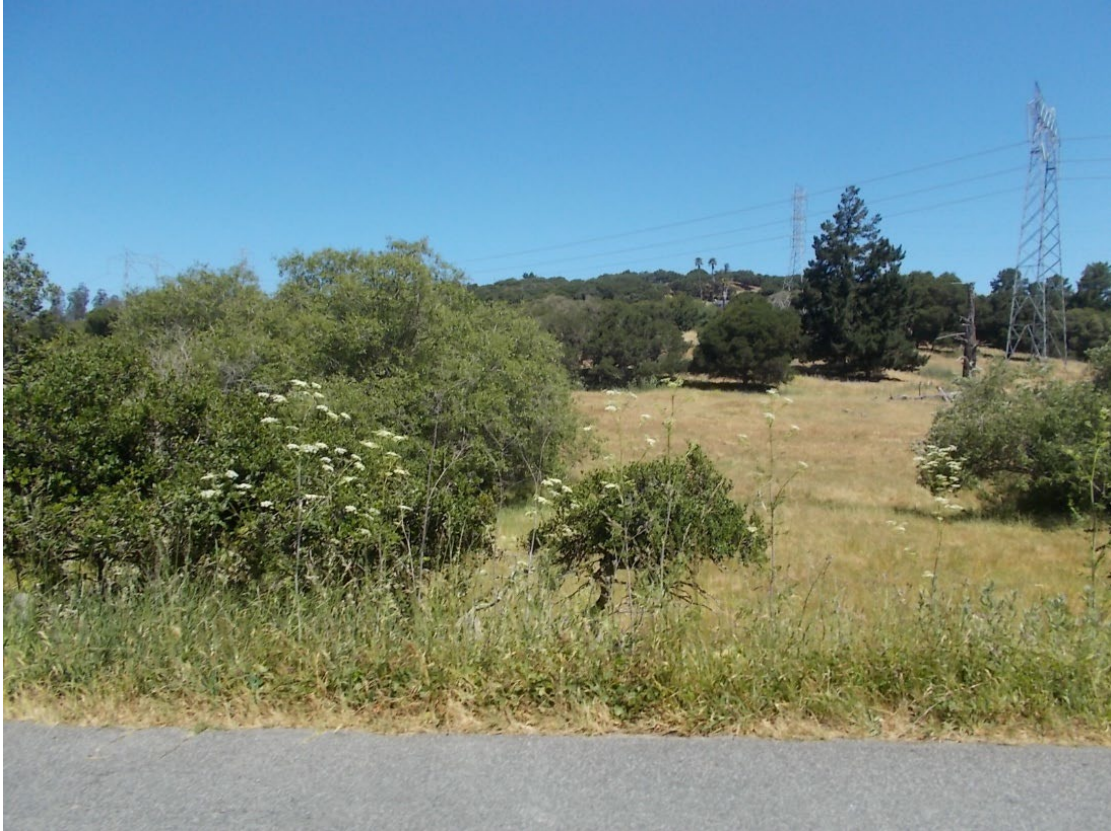
Looking northward from Pesante Road