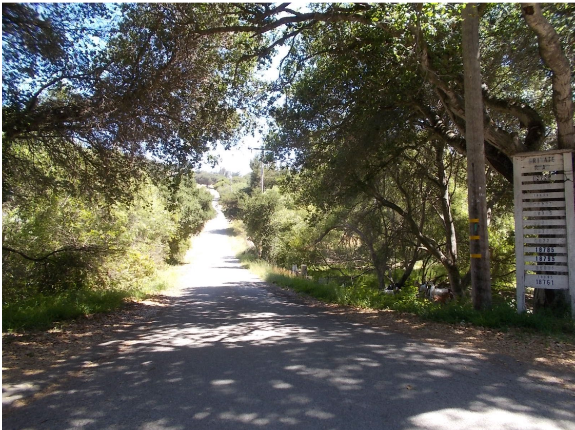
Accessing the western edge of the parcel