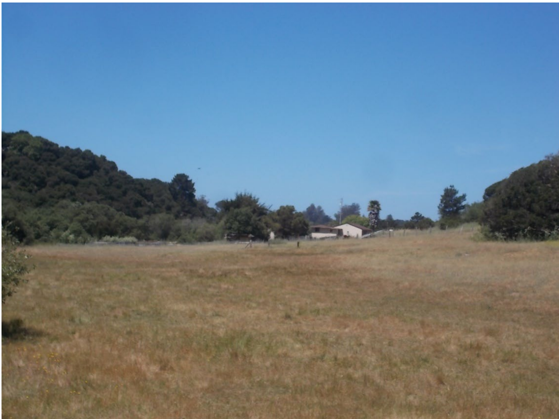
Looking west over the parcel (Parcels 2687 and 2688)