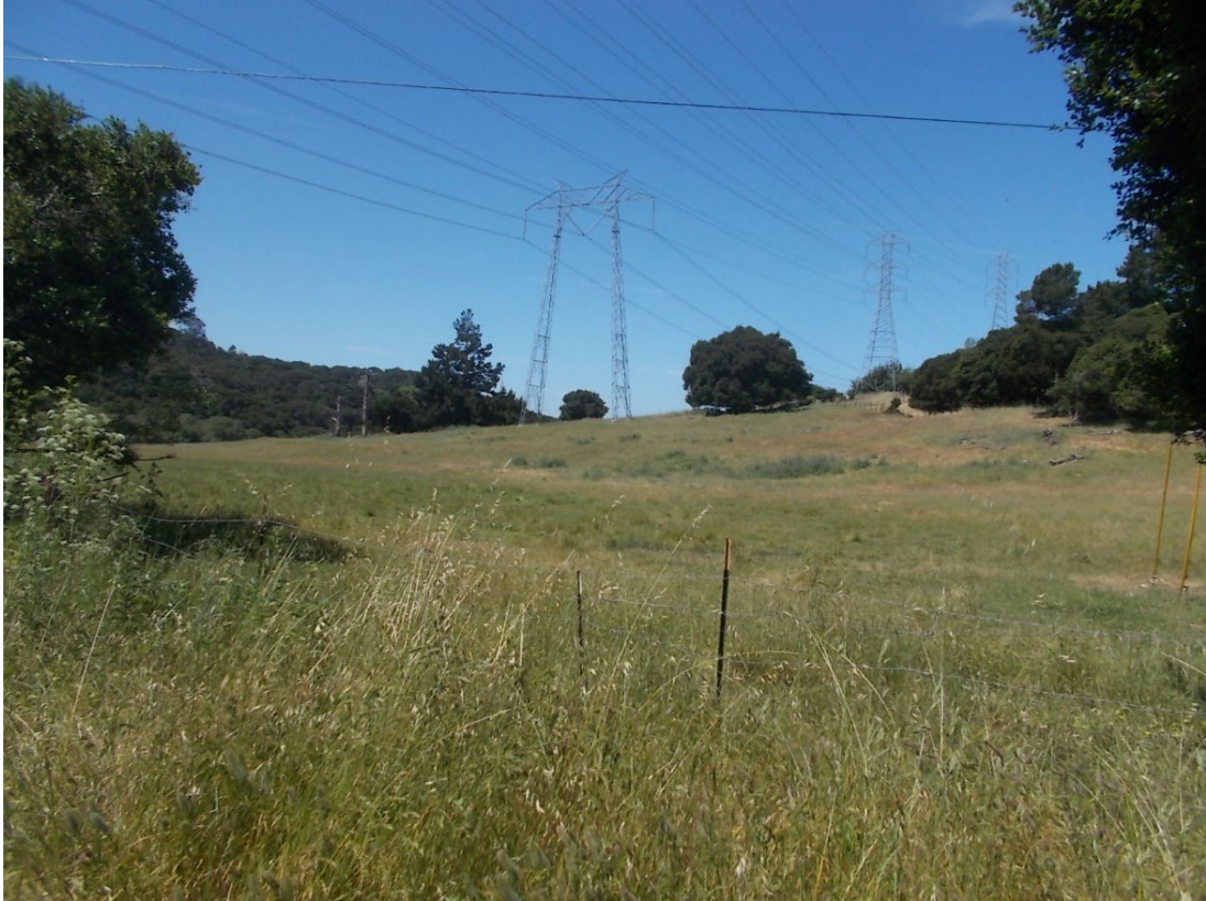
Looking west from Holly Hill Drive