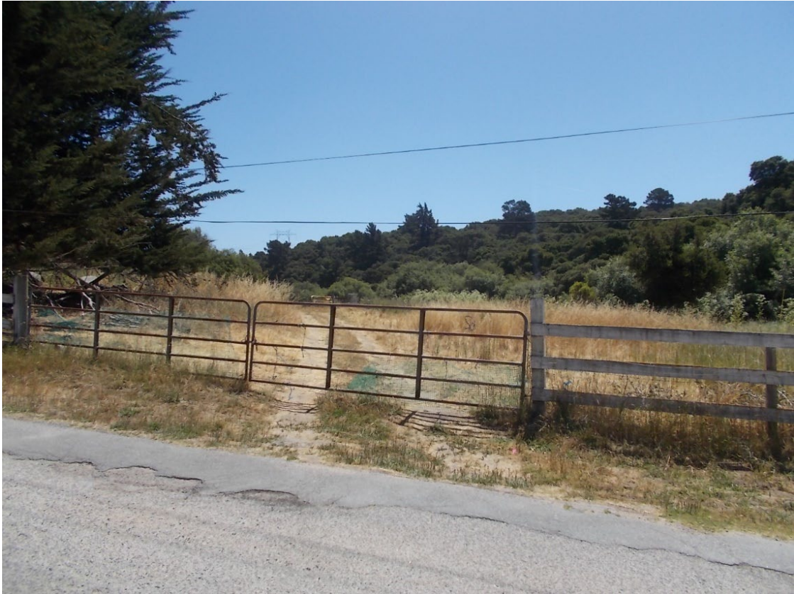
Looking east from the eastern edge of the parcel (Parcel 2688)