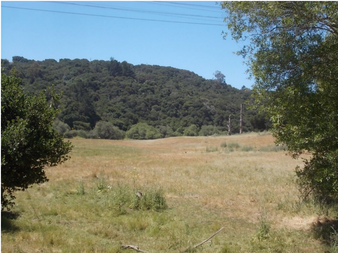
Looking southwest from Holly Hill Drive