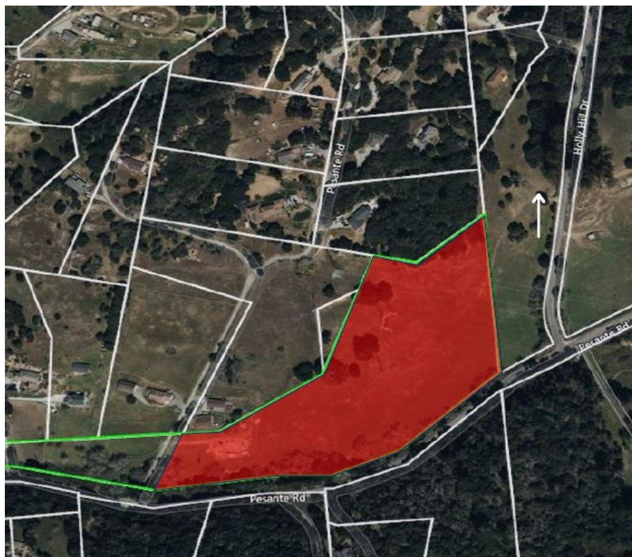
Aerial of the approximate boundary of Parcel DD 2686-02-01