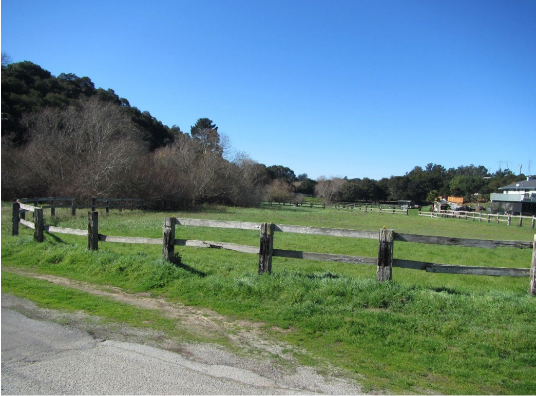
View southwest from northeastern edge of Parcel 2686