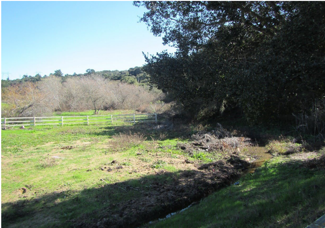
Photo looking east from drive between parcels 3004 and 3005