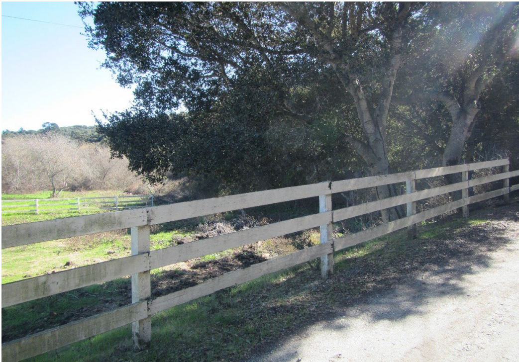
View northeast from Pesante Rd. Parcel 2642