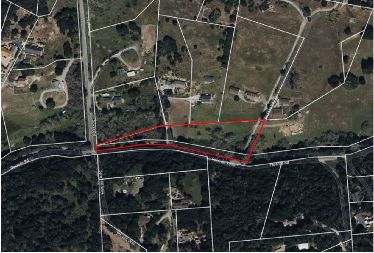
Aerial of approximate boundary of Subject Parcel DD2686-01-01 Parcel outlined in red