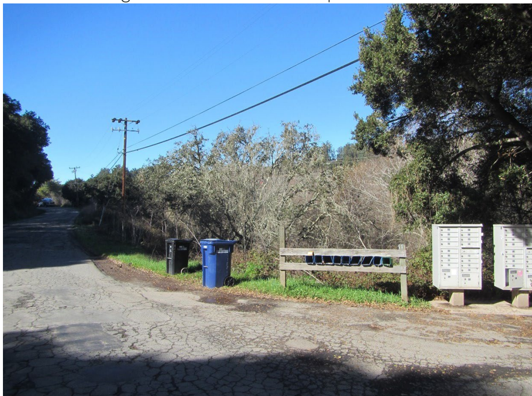
View west along Pesante Rd from eastern edge of Parcel 2686