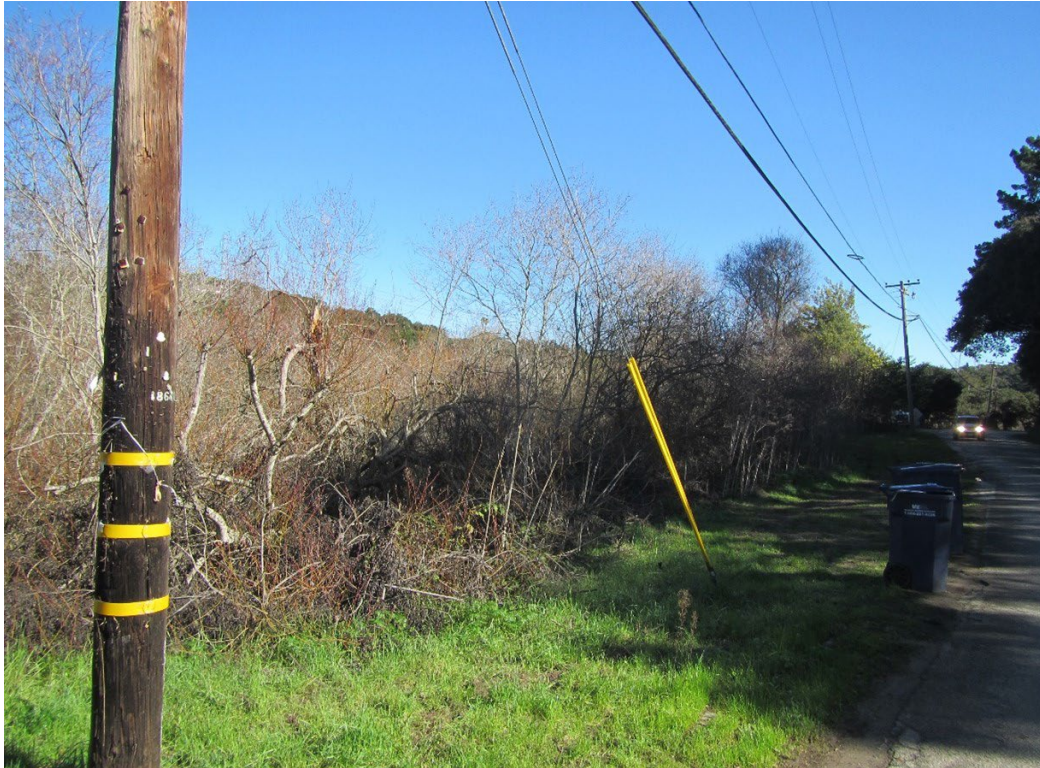
Photo looking east from corner of Coker Rd and Pesante Rd.