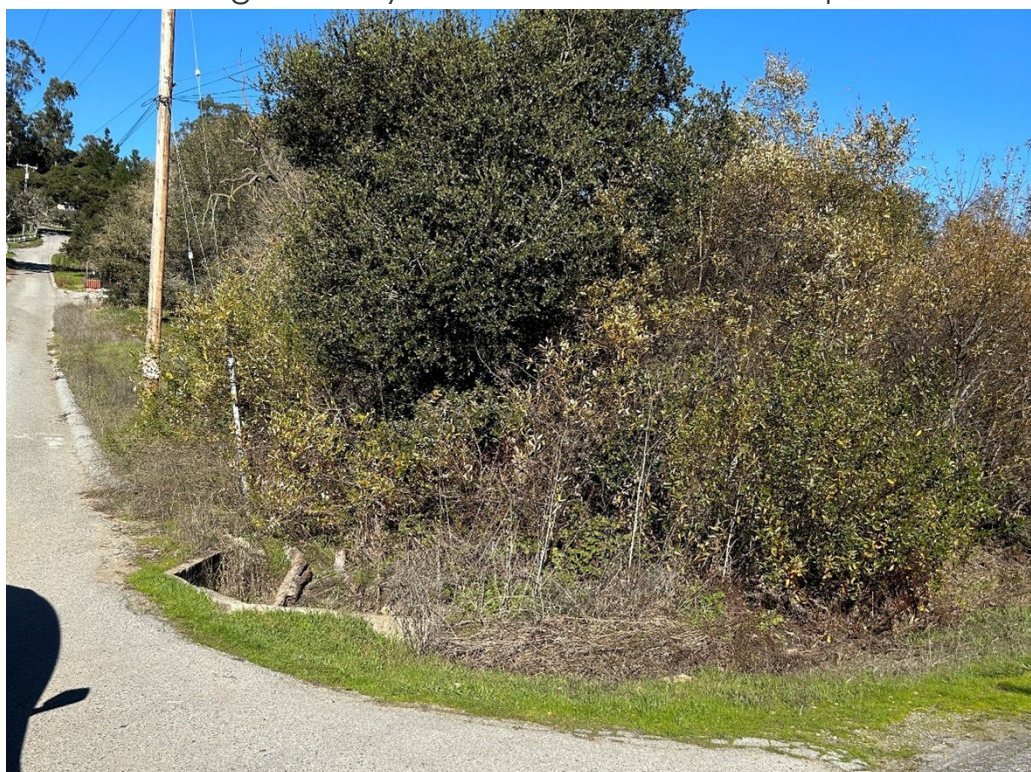
View northeast from Pesante Rd. Parcel 2642