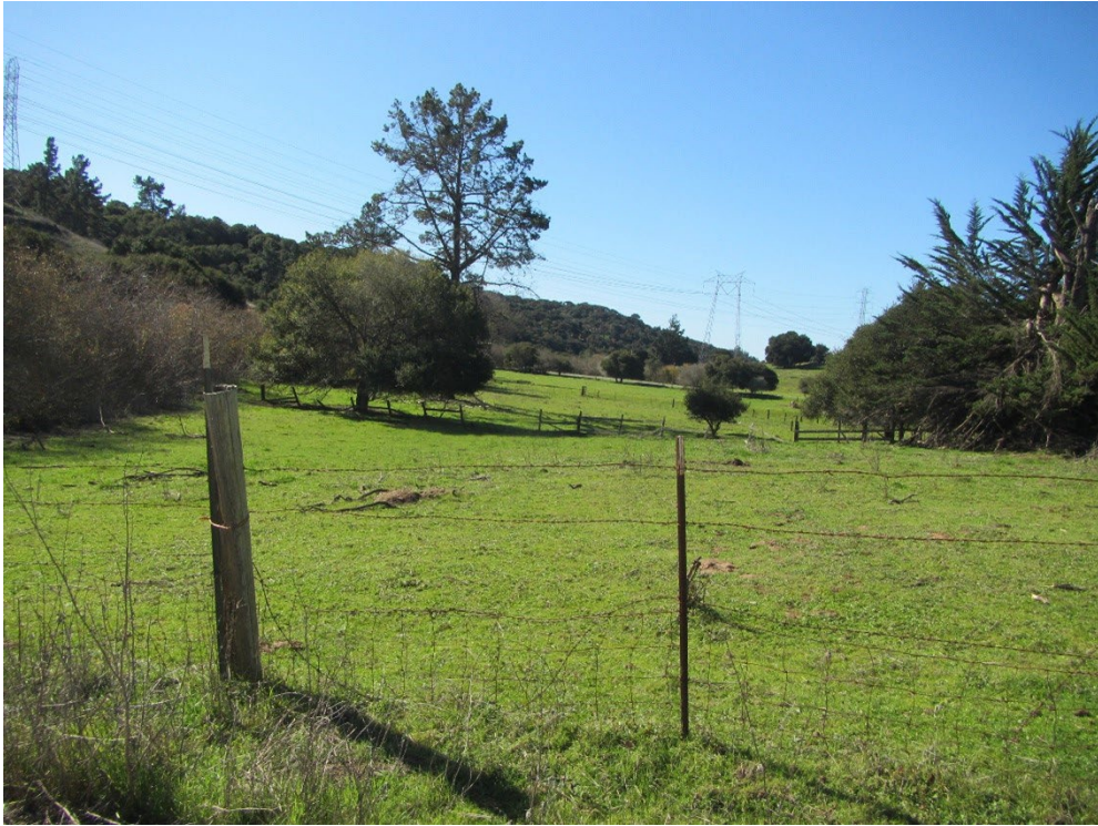
View looking west over parcel 2641