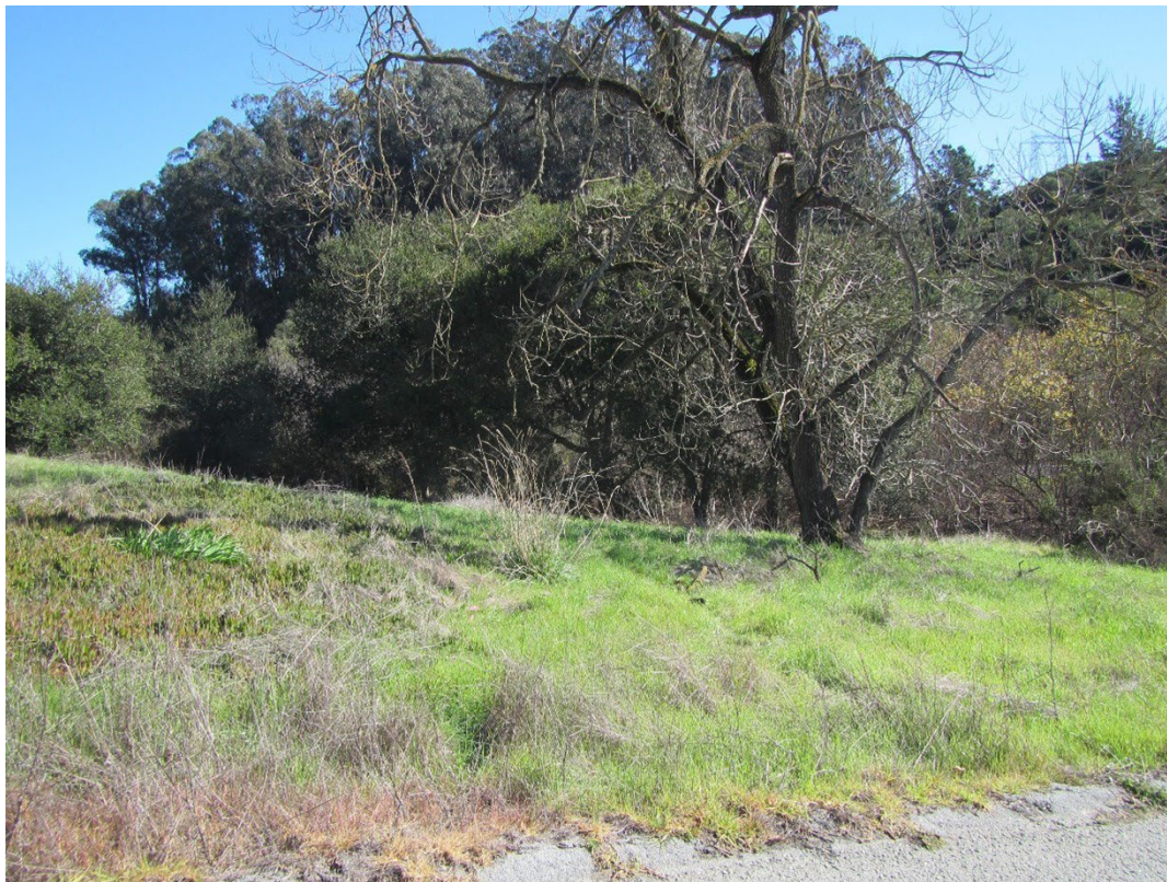
View looking southeast from easement (3107) over parcel 2642