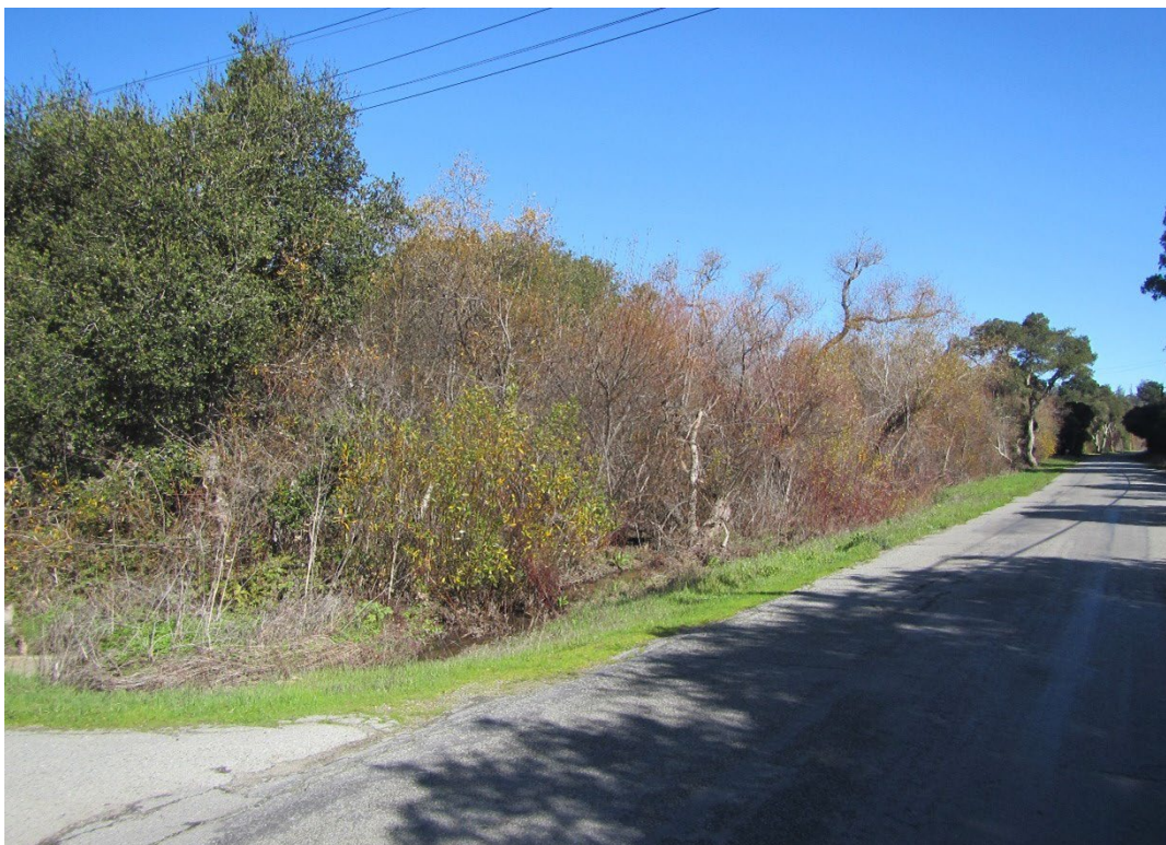
View eastward on Pesante Rd. Parcel 2642