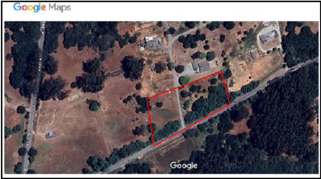
Aerial of approximate boundary of Subject Parcel DD2641-01-01 Parcel outlined in red