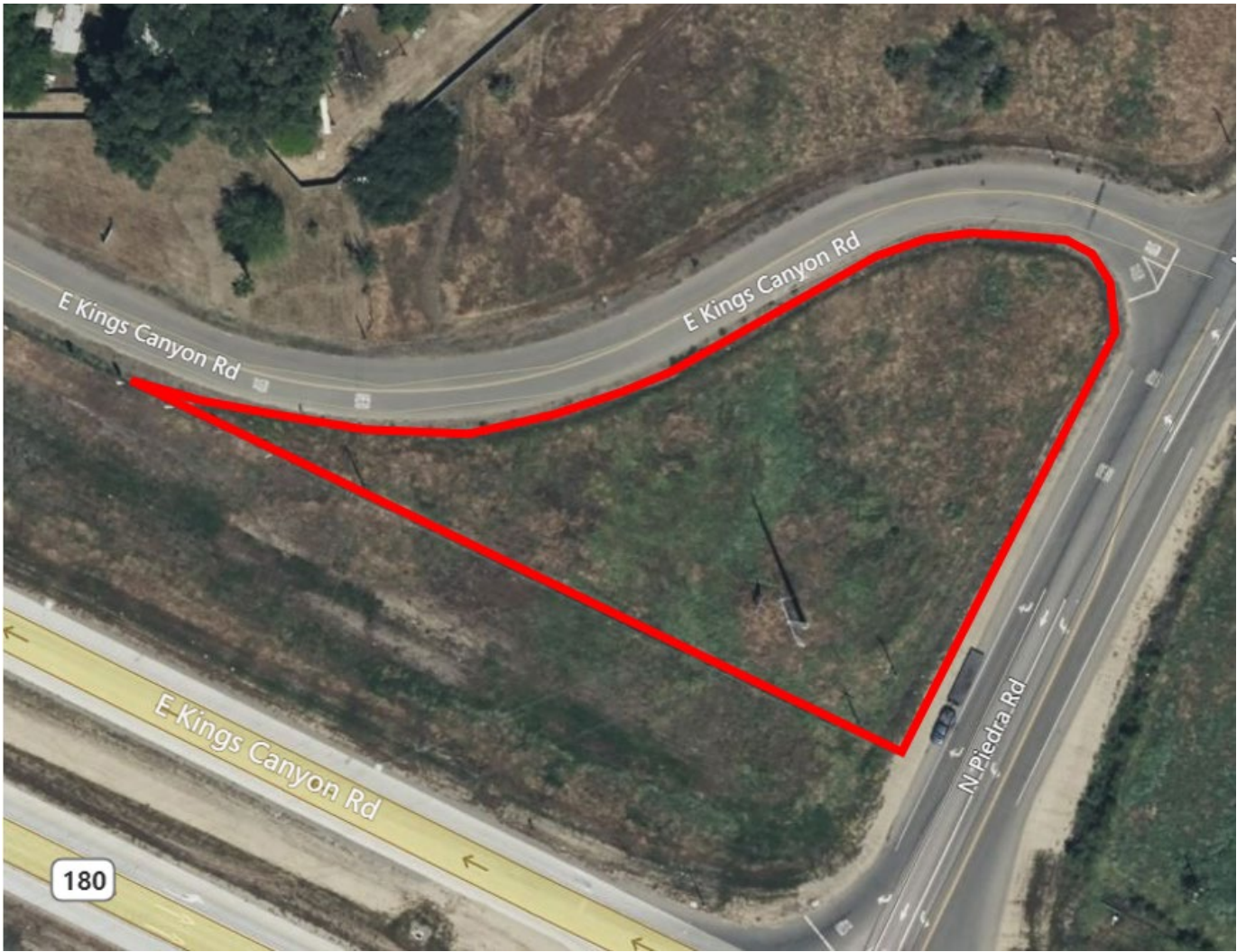
Aerial View of Parcel 84593-02-01 (Drawing is not to scale)