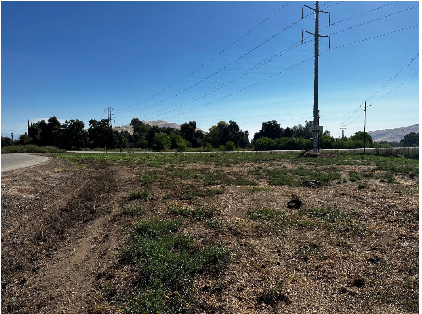
On Riverbend RV Park Road looking east at the property.