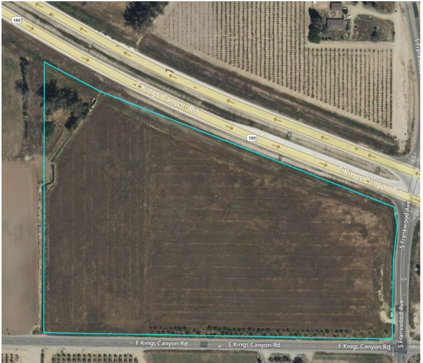
DD 83240-02-01 Aerial View (Drawing is not to scale)