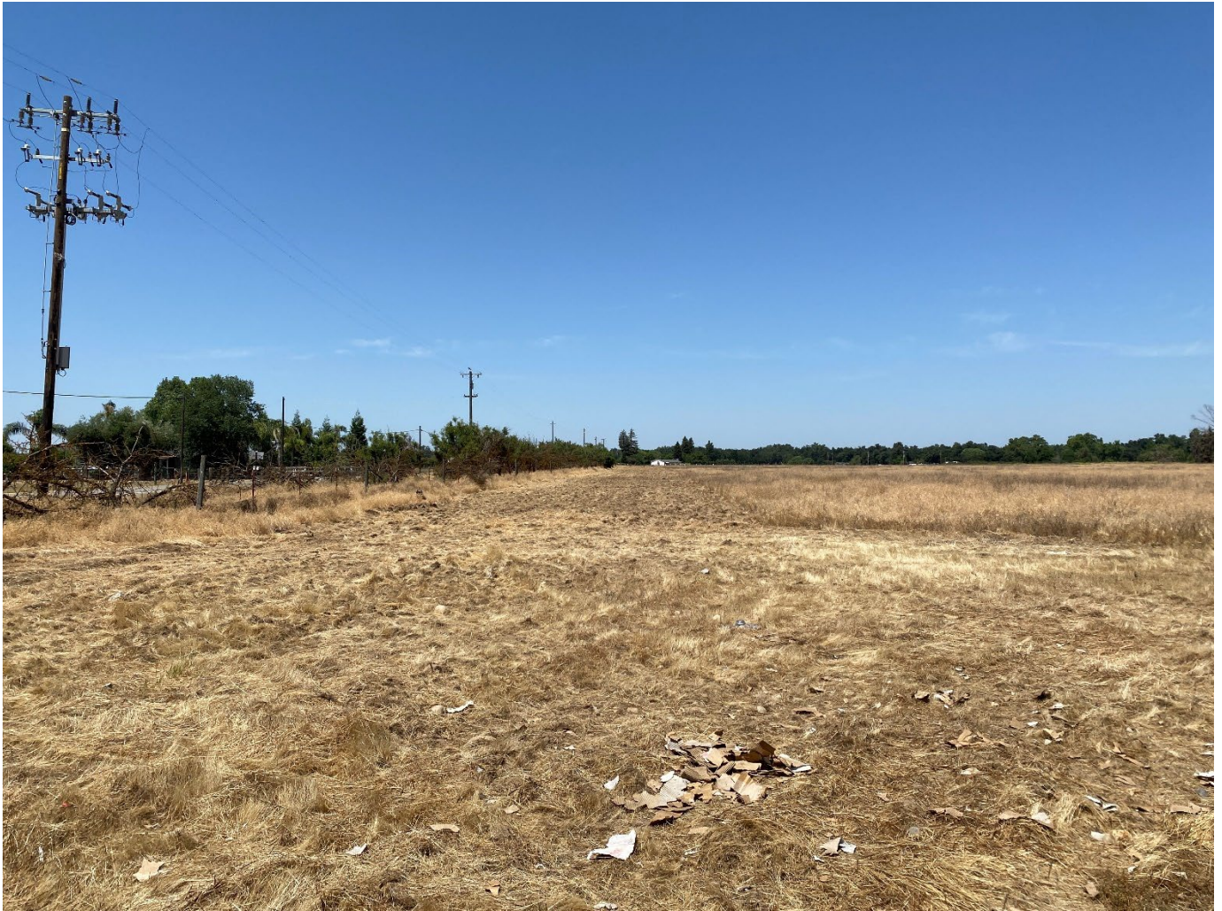
On S Frankwood Ave looking west at the property.