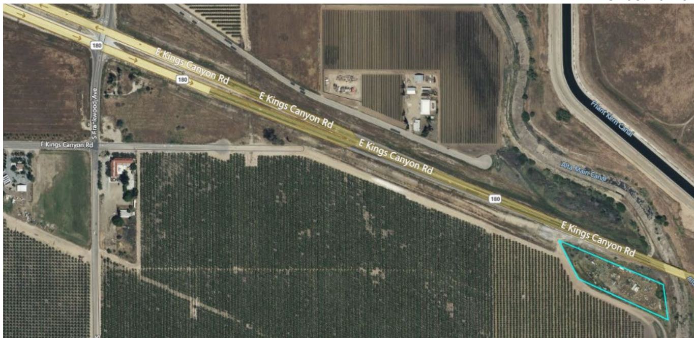
DD 84637-01-01 Aerial View (Drawing is not to scale)