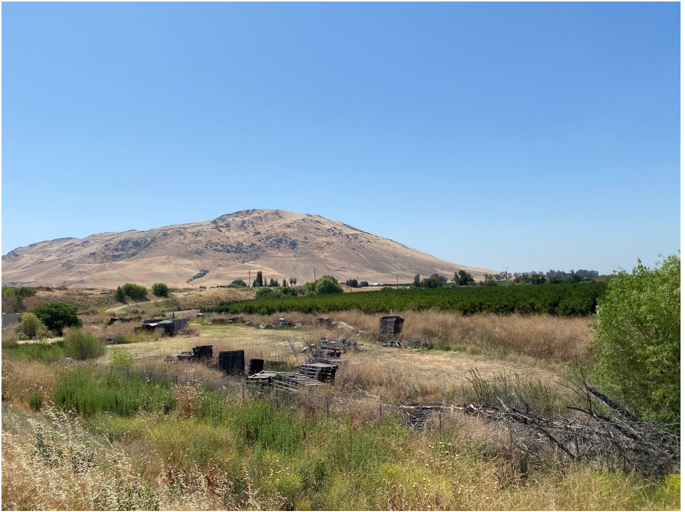
On State Route 180 looking at the southwest corner of the property.