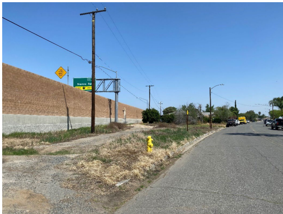
Looking northwesterly at subject property from Johns Rd.