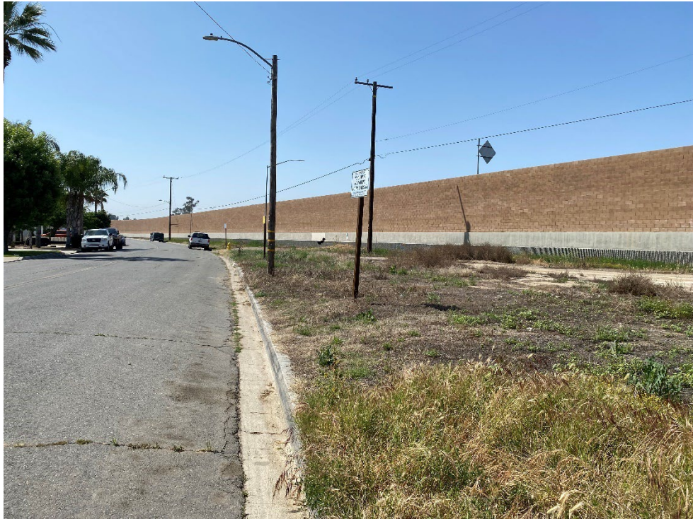
View looking southwesterly at the subject property from Johns Rd.