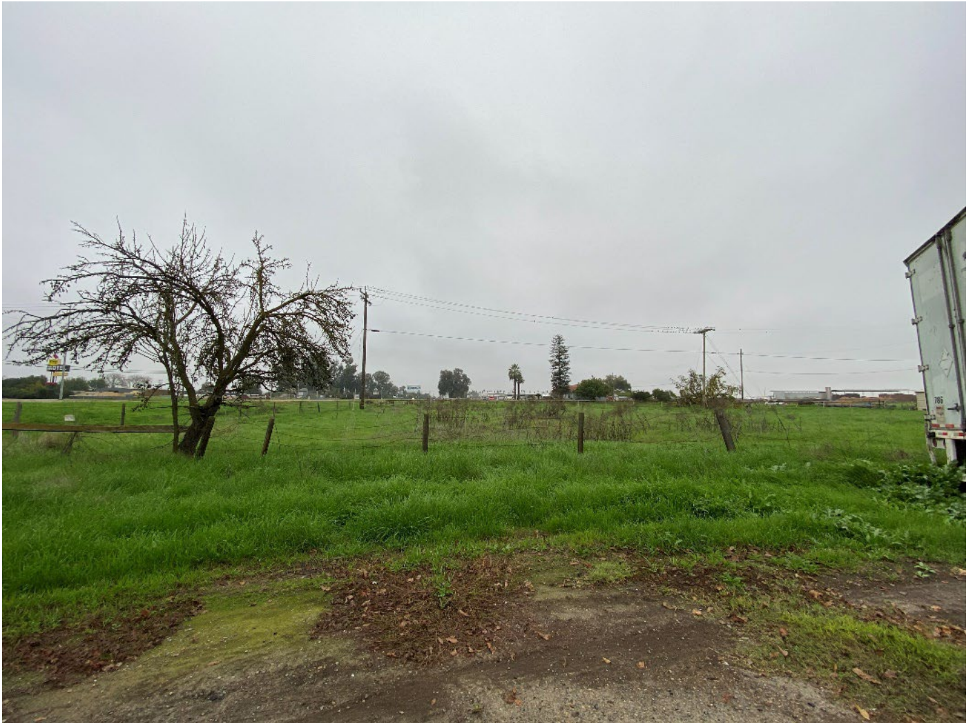
Looking south from Fair Oaks Ave.