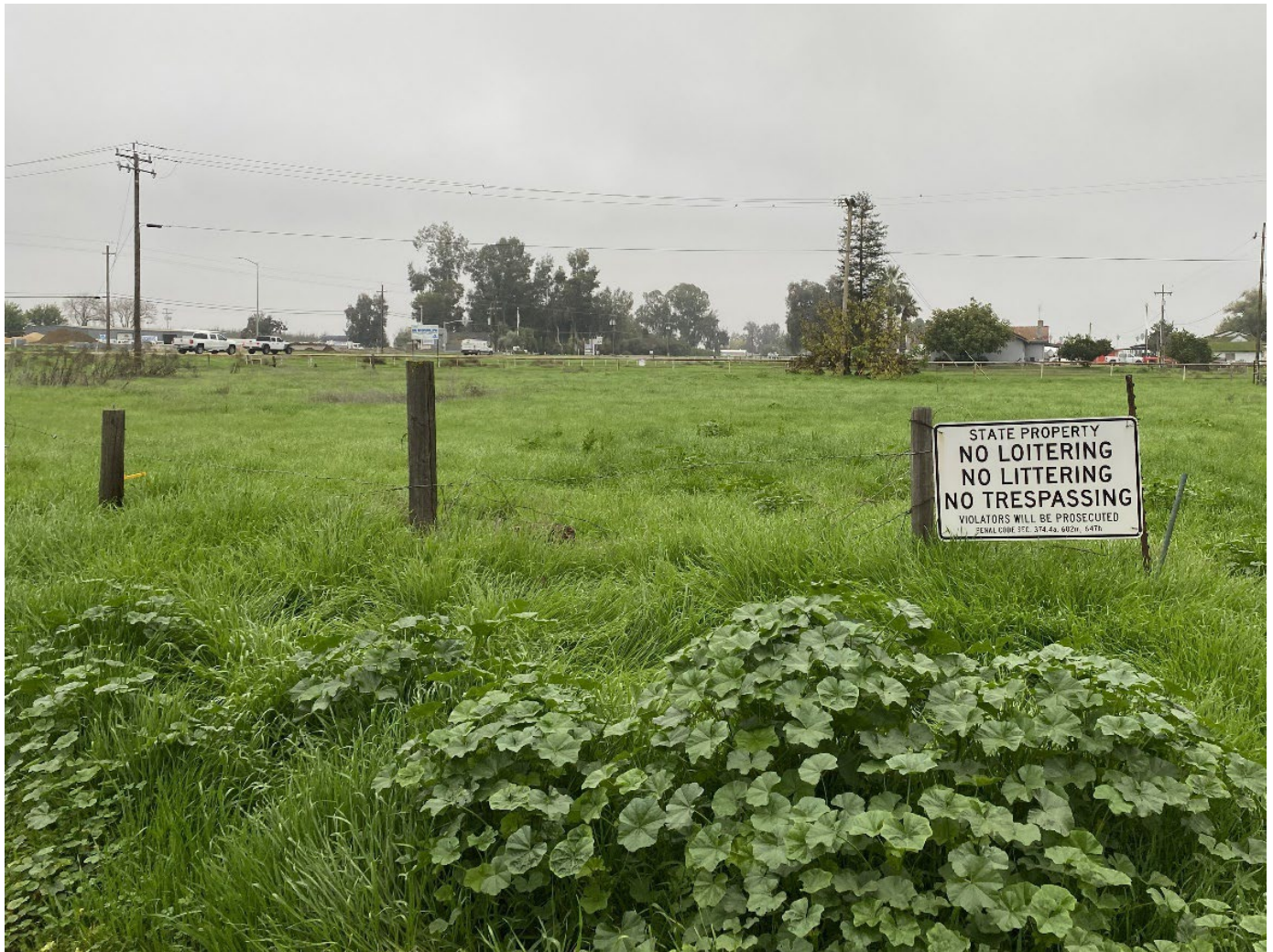
Looking southeast from Fair Oaks Ave.