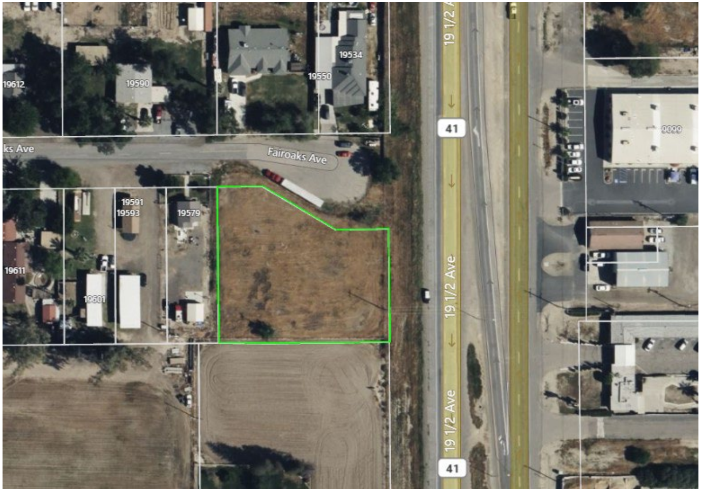
Aerial View of parcel highlighted in green (drawing is not to scale)