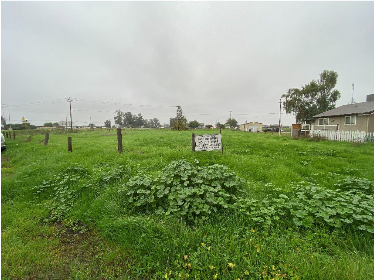
Looking southeast from Fair Oaks Ave.