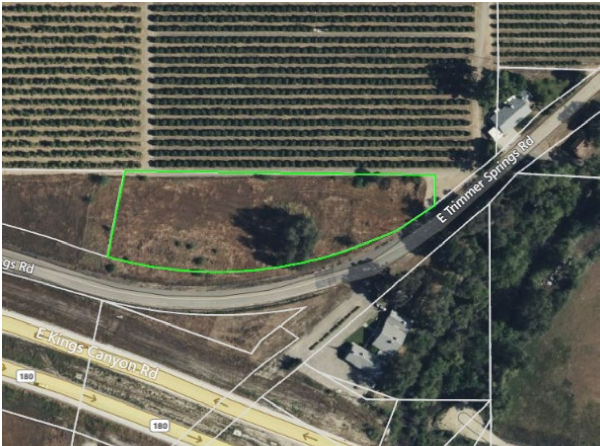
DD 86016-01-01 Aerial View (Drawing is not to Scale)