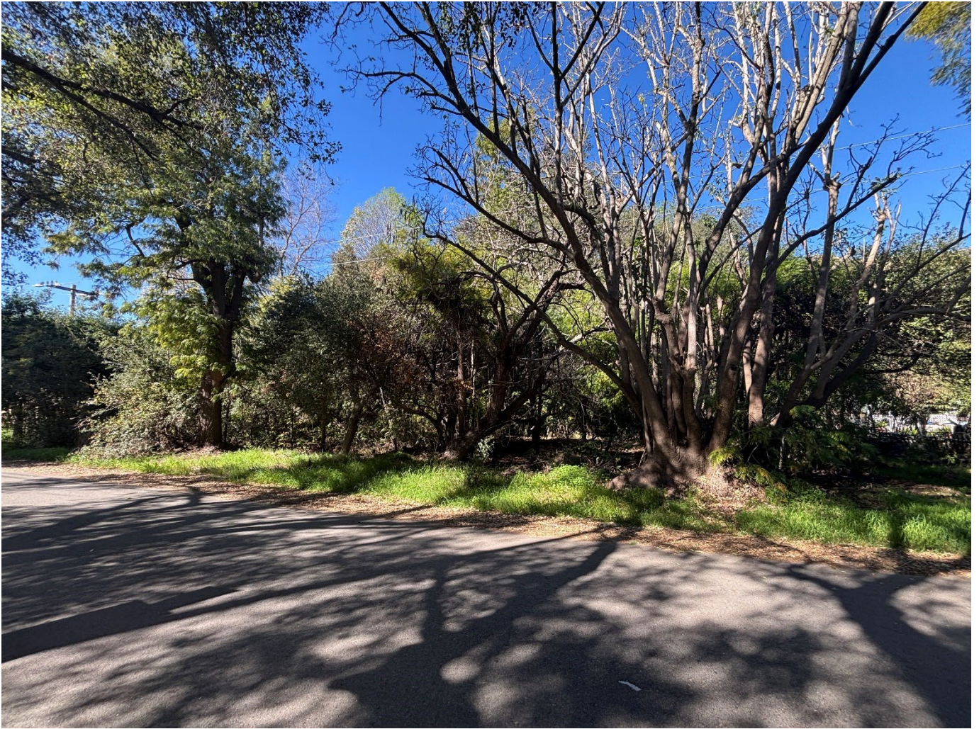
View looking west at the property from Rainbow Canyon Road