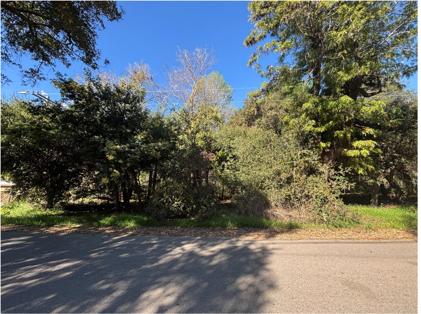
View looking northwest at the property from Rainbow Canyon Road