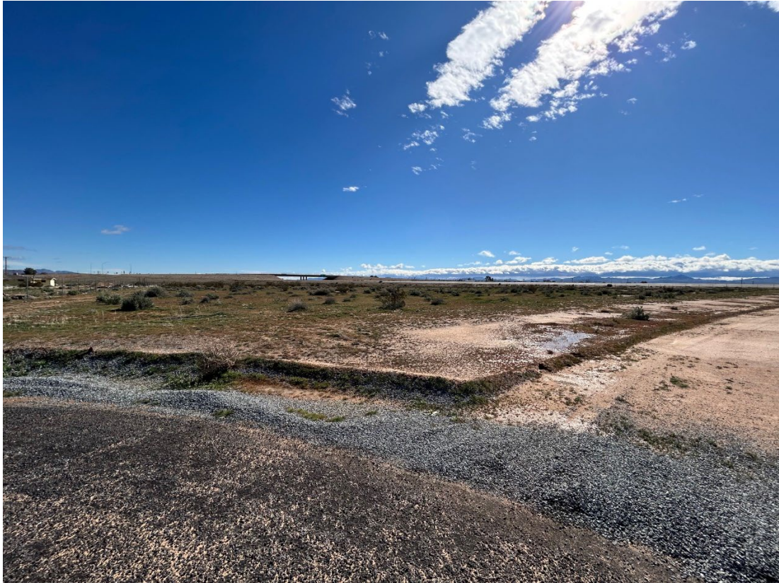
Looking southeasterly at subject parcel from Locust Street.