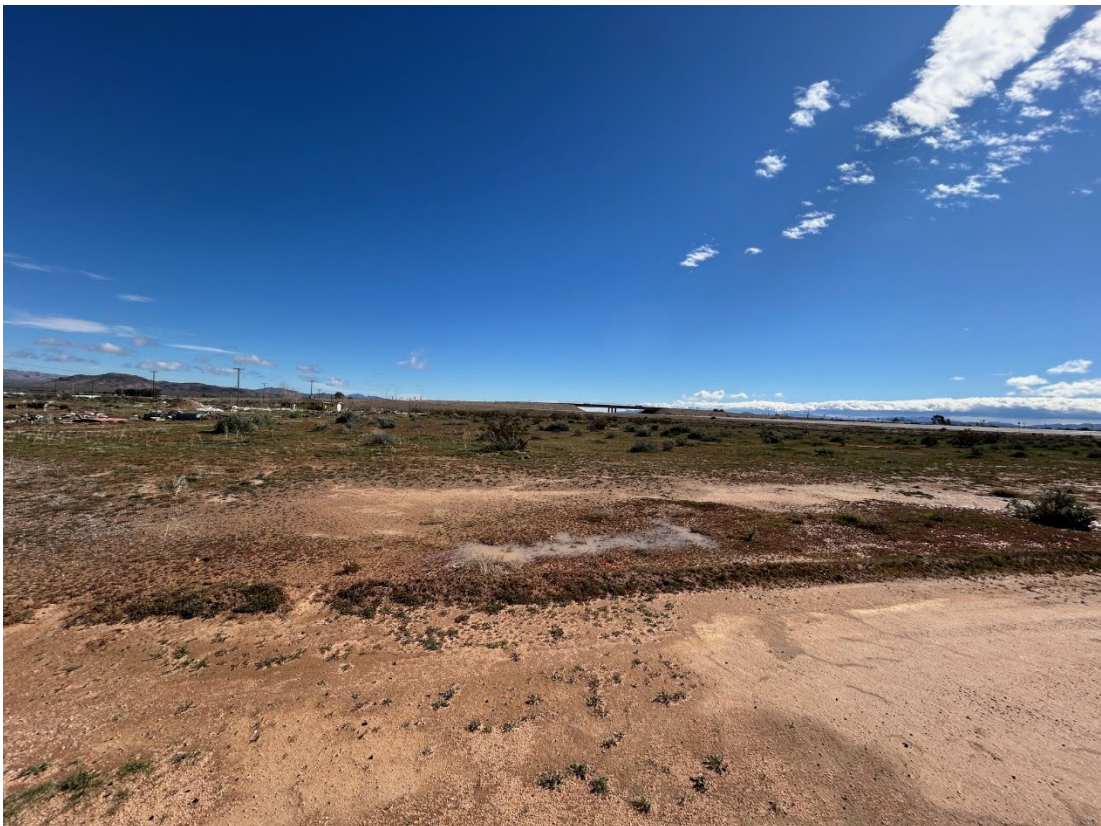
View looking easterly at the subject parcel.