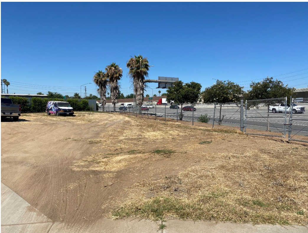
View looking west from Malta Place.