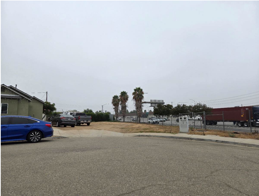
View looking southwest from Malta Place.