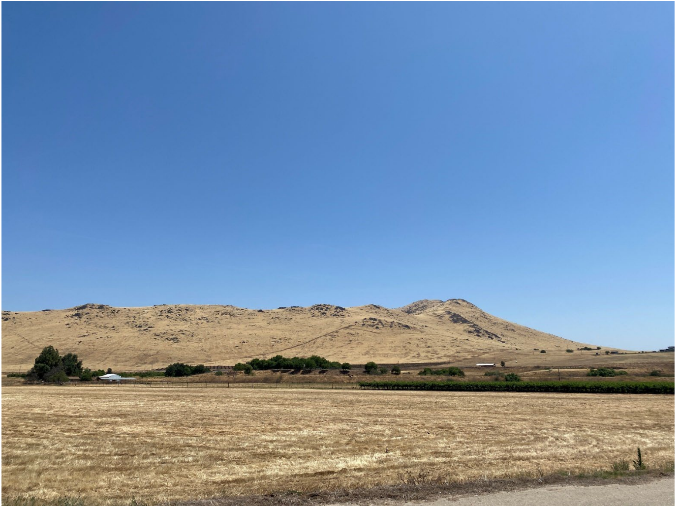
On E Kings Canyon Road looking northeast at the property.