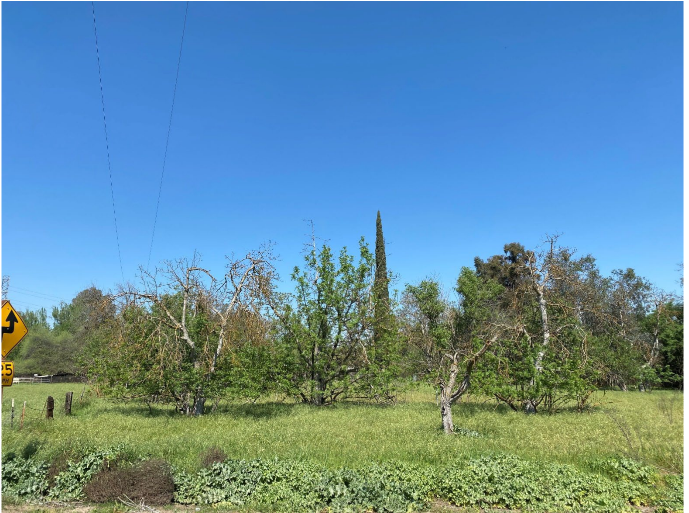
Looking northwest at the parcel.