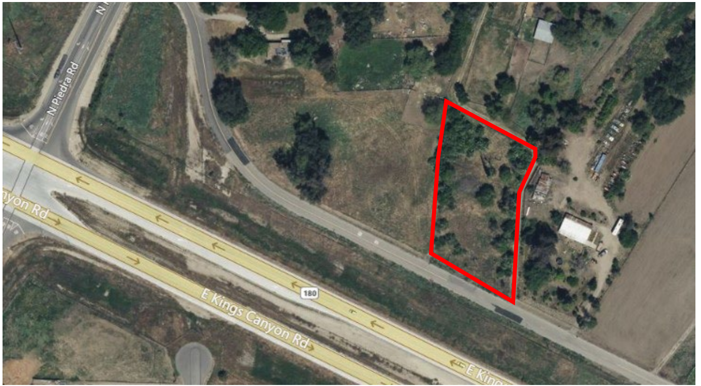
DD 84603-01-01 Aerial View ( Drawing is not to scale)