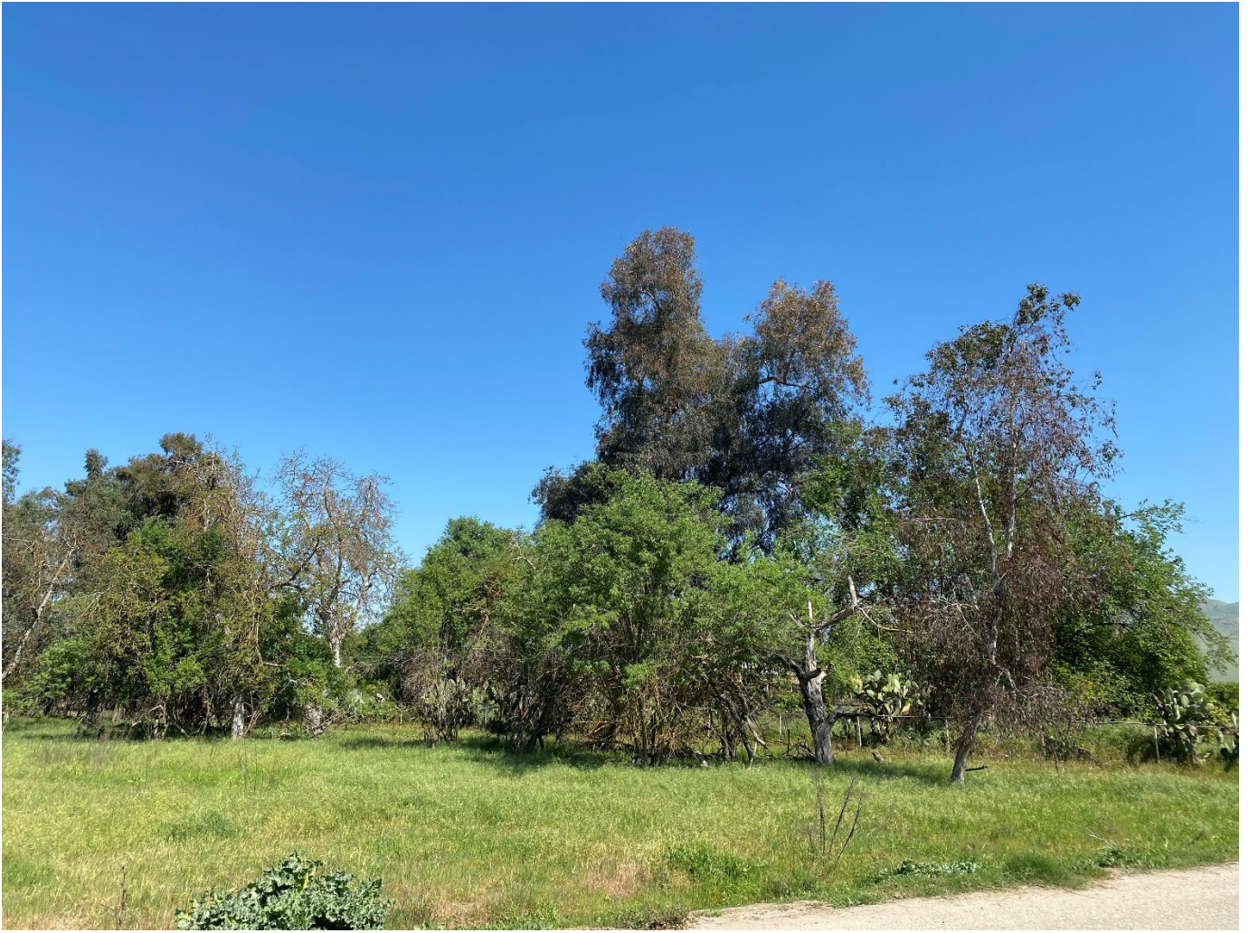
Looking northeast at the parcel.