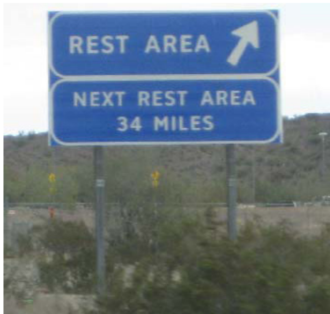
Figure 2 Safety Roadside Rest Area sign in Arizona

Caltrans is proceeding with an update to the Safety Roadside Rest Area Master Plan incorporating the findings from this research.