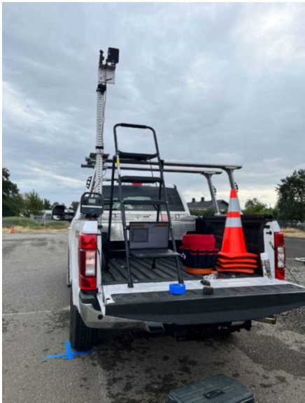
Image 4: Mounting, setup and transport apparatus for detector testing