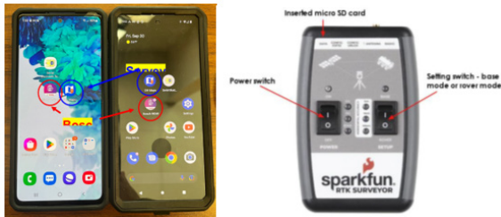
Image 1: Mobile phones with the custom Bosch app installed (left) and a GPS coordinate logger (right)