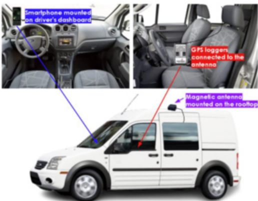
Image 2: Mobile phone and GPS coordinate logger installed in a test vehicle