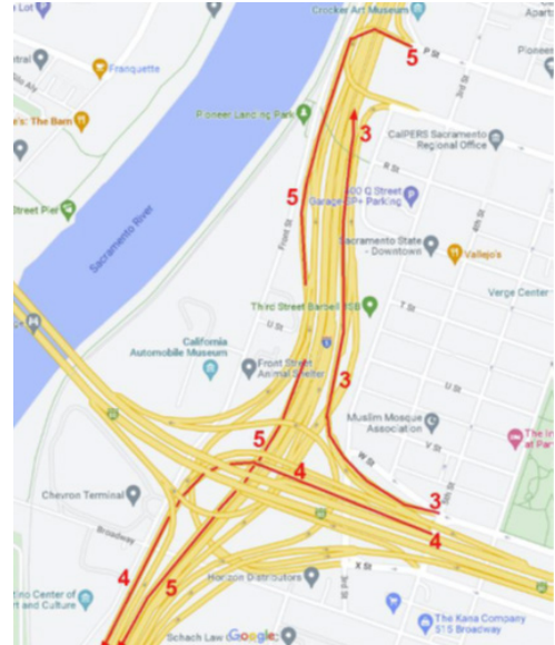
Image 4: 3 of the 5 test ramps on which the researchers drove as shown in Google Maps