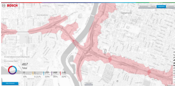
Image 3: Detection area (pink) encompassing the Sacramento test ramps as shown on the Bosch map server