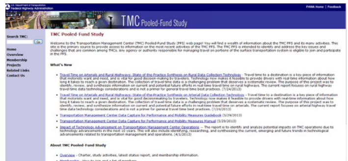
Image 1: Federal Highway Administration (FHWA) TMC Pooled Fund Study Website