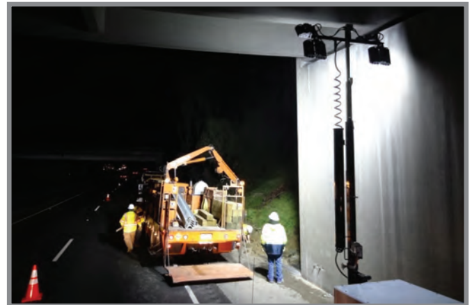
Night guard rail repair

The final report will be available June 2014.