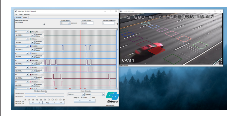
Image 2: Analyzing preliminary data and video from the North Main Street location in VideoSync